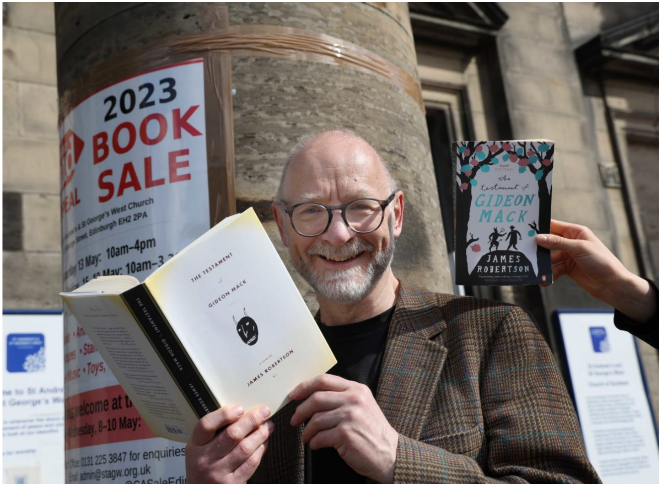
Pictured is Scottish writer James Robertson – Patron of this year's book sale and author of The Testament Of Gideon Mack which is currently one of the texts studied by students sitting National 5 English exams.