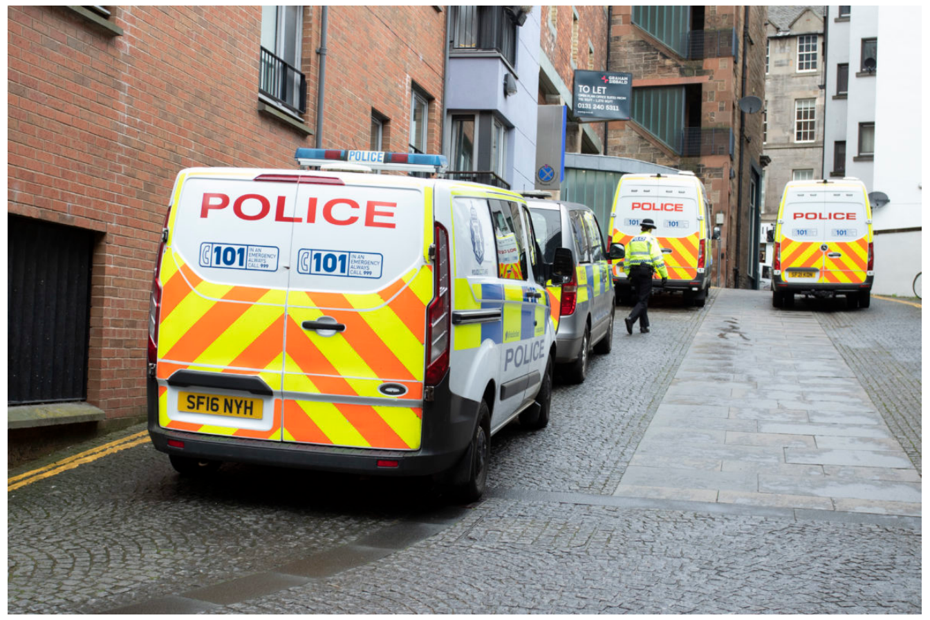
Police at SNP Headquarters Edinburgh after police arrested Peter Murrell in connection with party's finances.