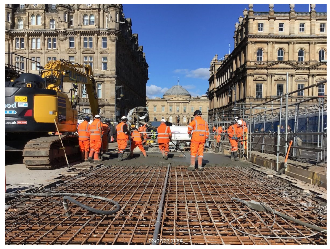
Concrete Deck pour to Bay C