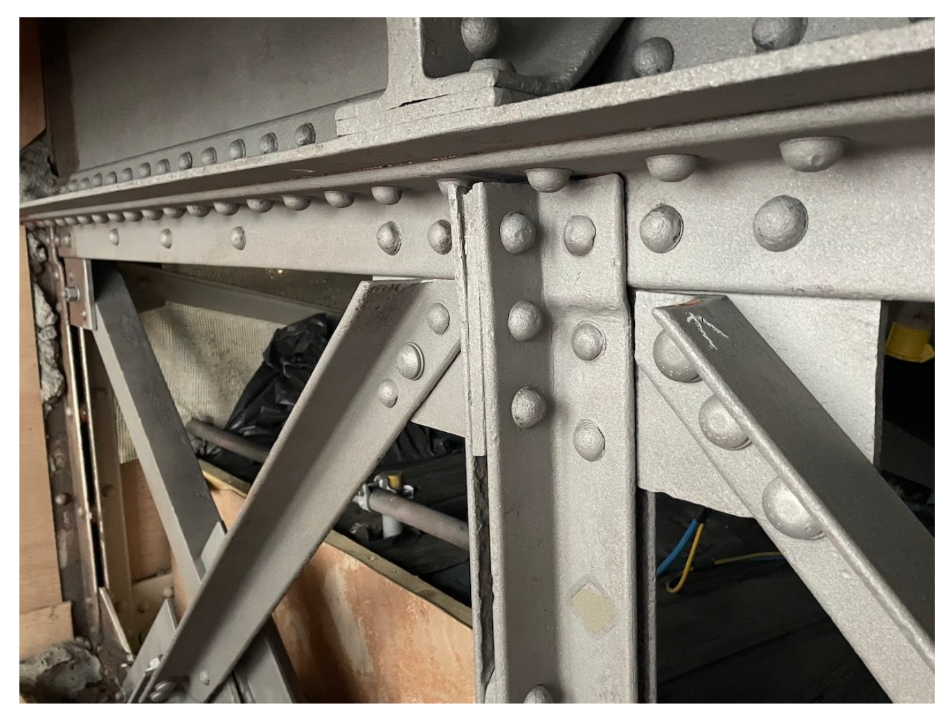
Freshly blasted 1890s steelwork