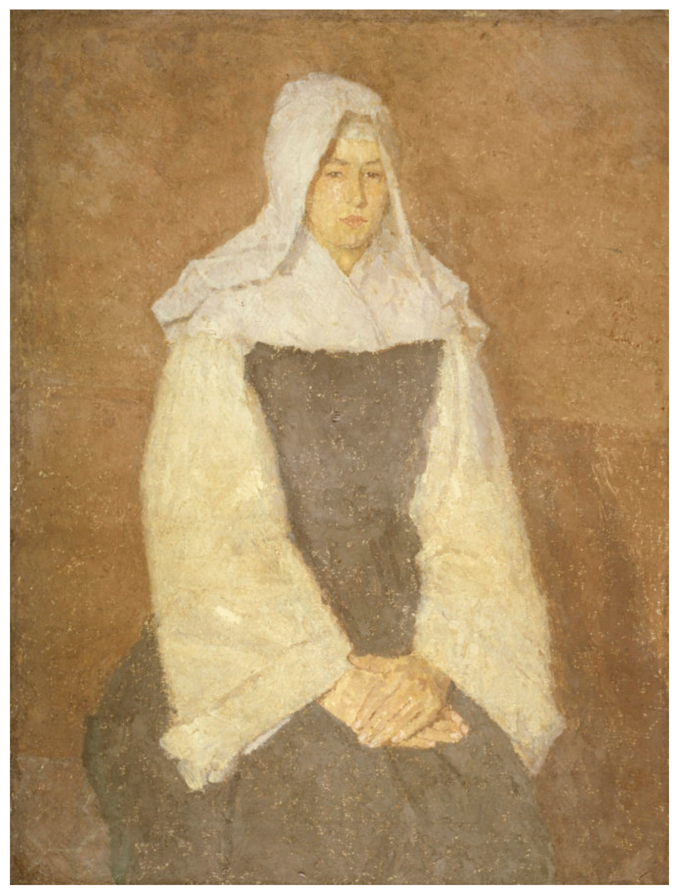
Gwen John, A Young Nun , about 1915 – 1920. Collection: National Galleries of Scotland, purchased 1970.