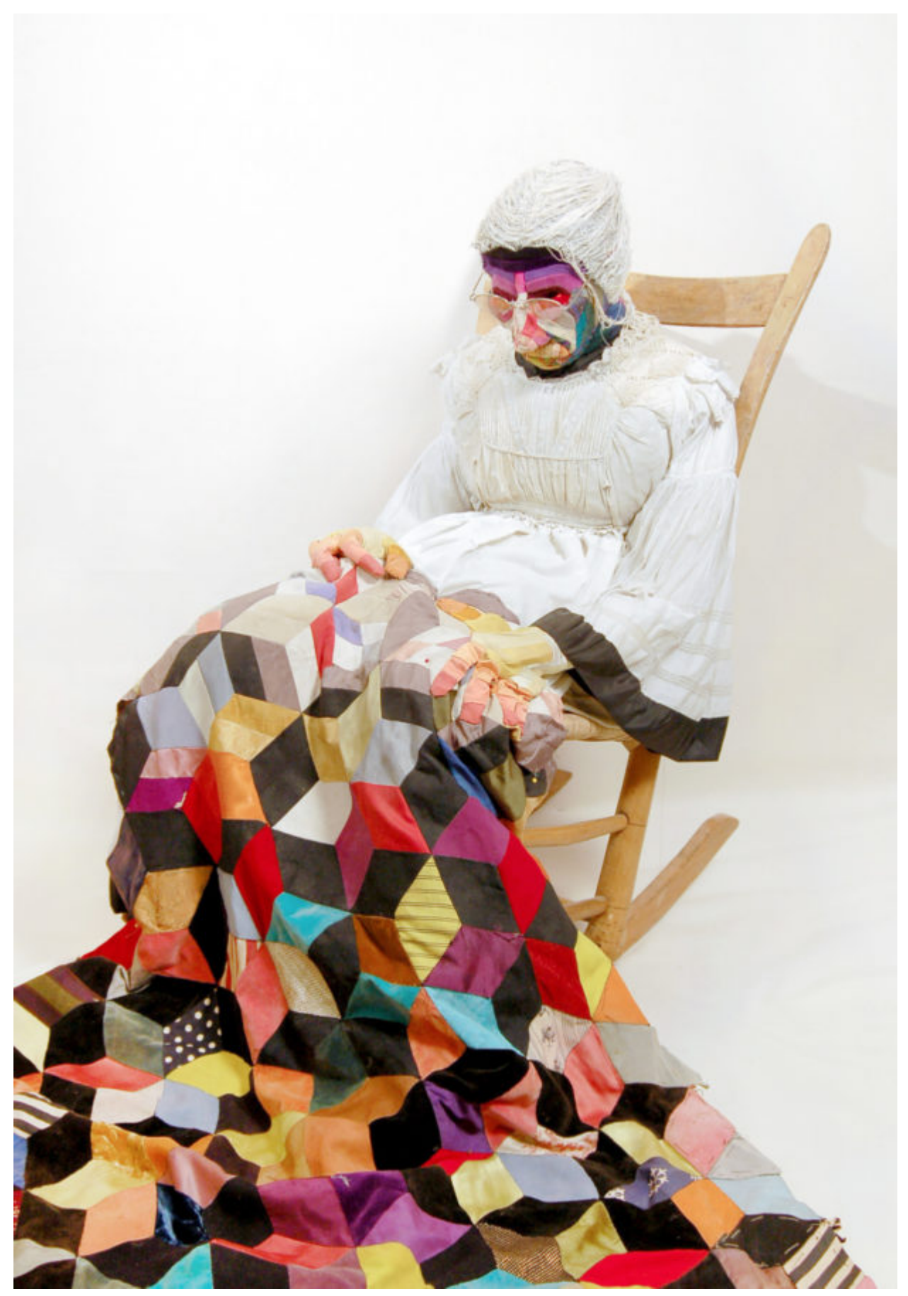
ann Haworth, Old Lady II, 1967. Collection: National Galleries of Scotland, purchased with help from the Henry and Sula Walton Fund, 2021.