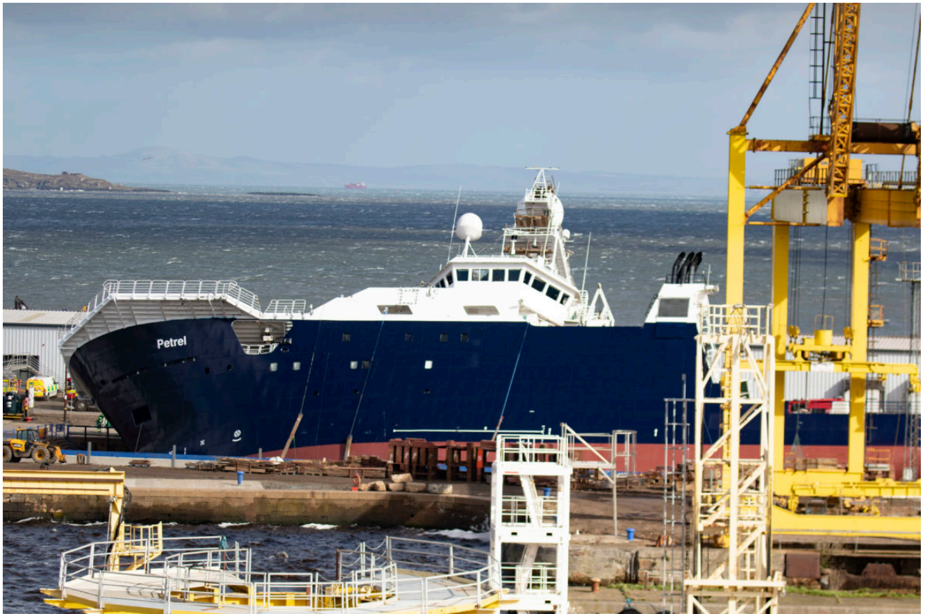
Major incident at Leith Imperial Dry Dock as ship RV Petrel owned by Microsoft co-founder Paul Allen is on its side an air ambulance is on the scene.