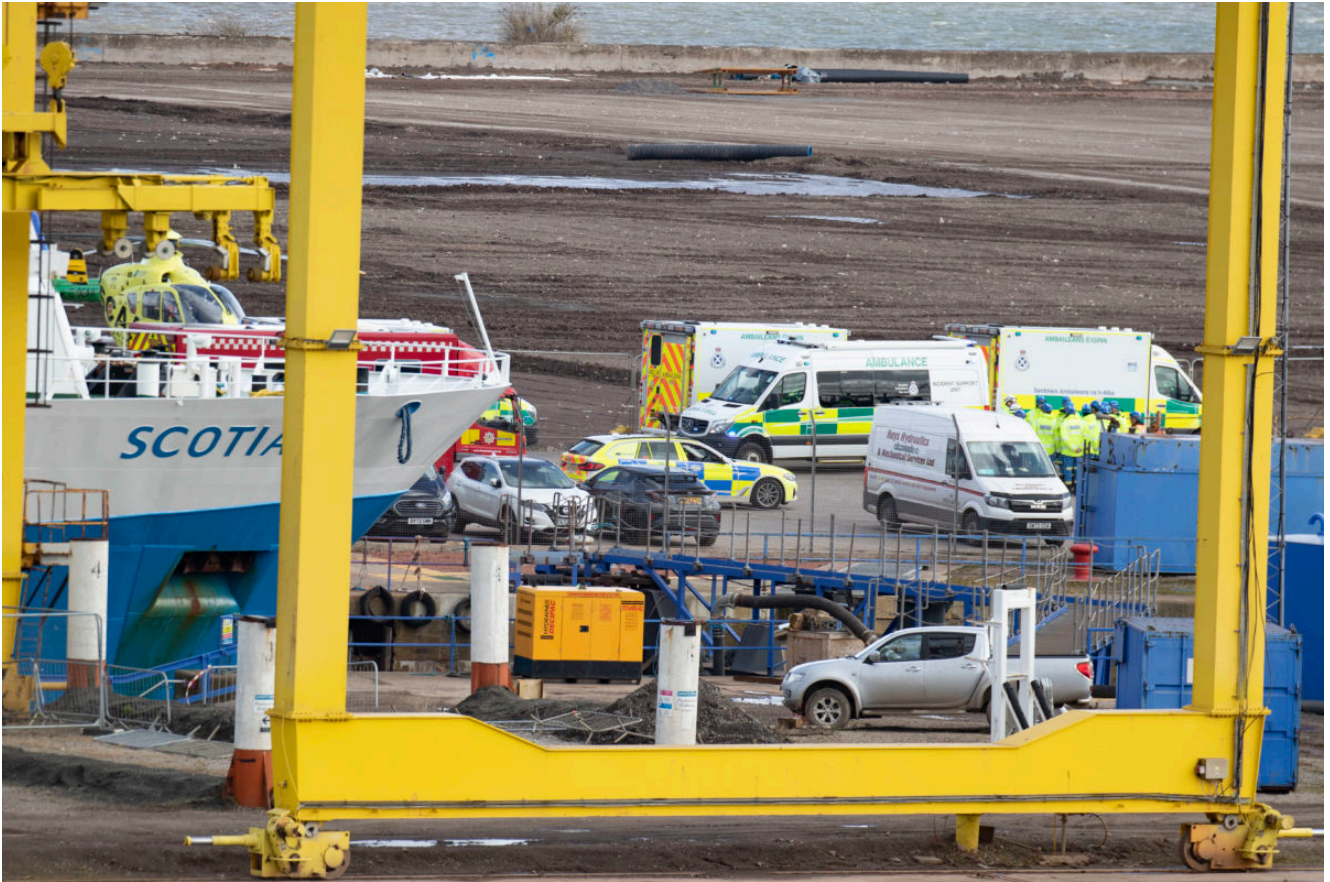
Major incident at Leith Imperial Dry Dock as ship RV Petrel owned by Microsoft co-founder Paul Allen is on its side an air ambulance is on the scene.