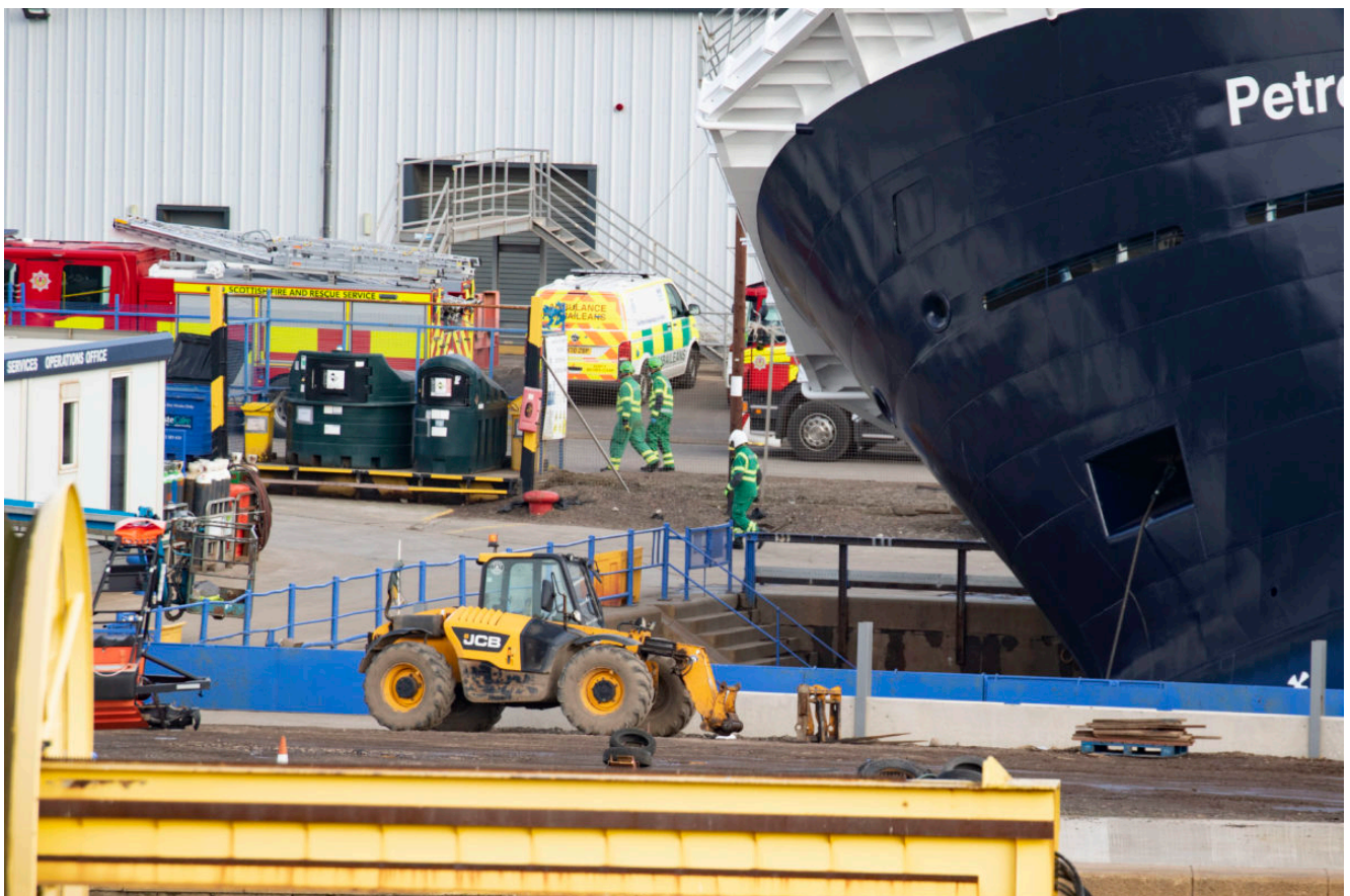
Major incident at Leith Imperial Dry Dock as ship RV Petrel