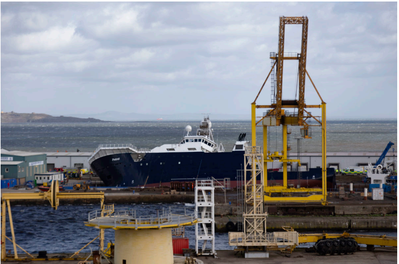
Major incident at Leith Imperial Dry Dock as ship RV Petrel