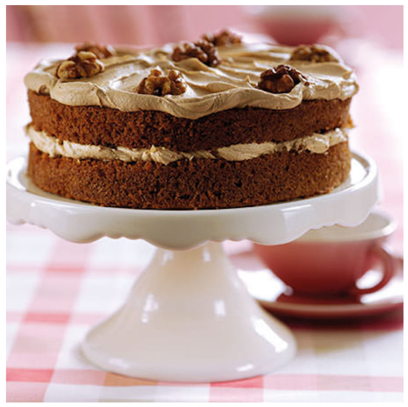
Coffee and walnut cake