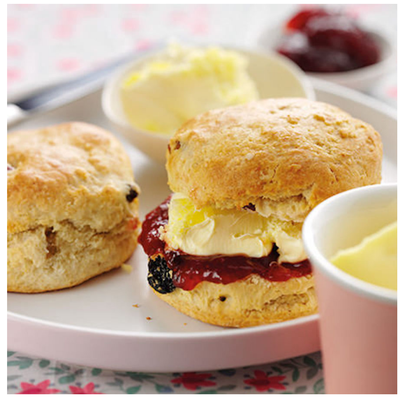
Trex Fruit Scones