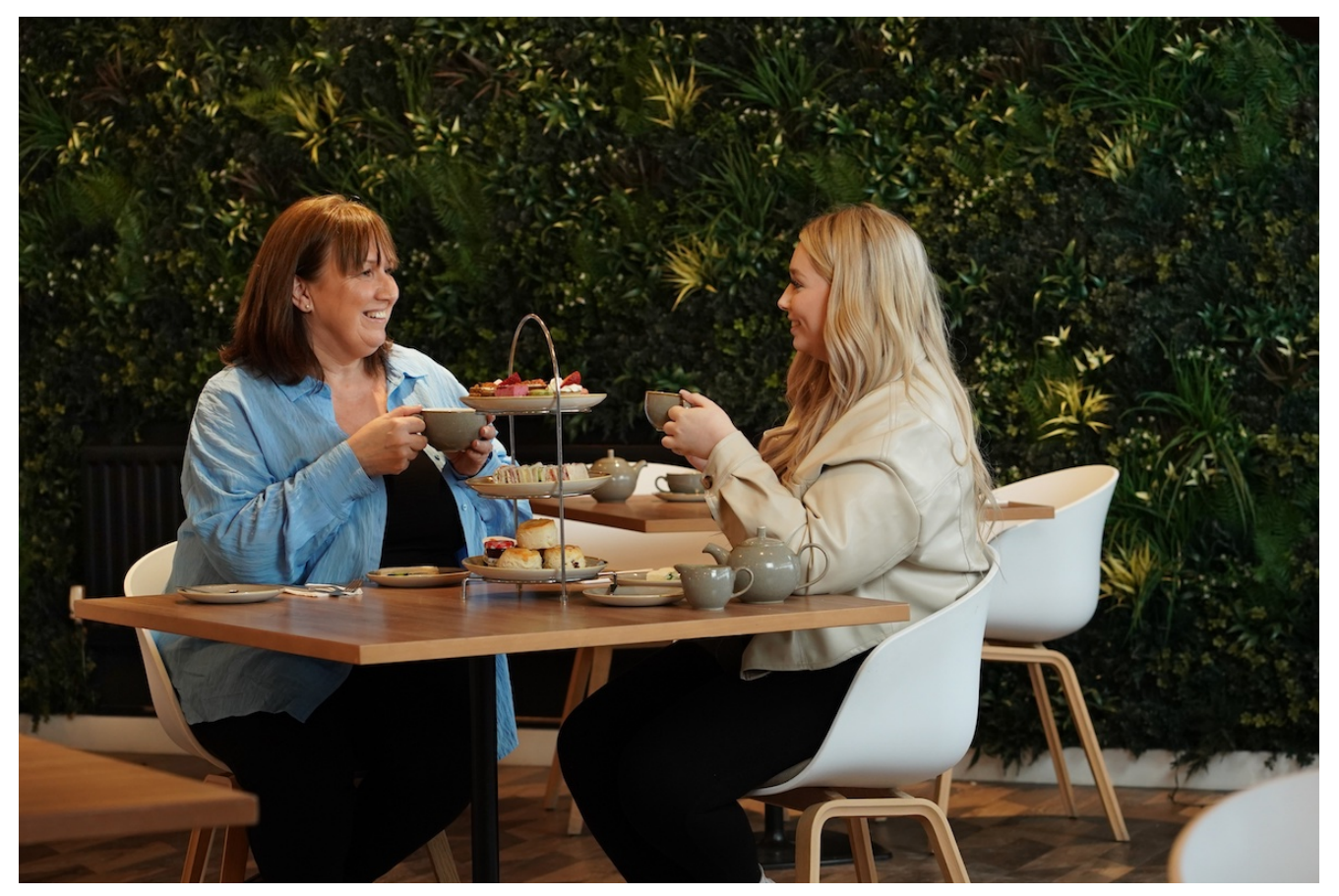
Mother's Day Afternoon Tea at Dobbies