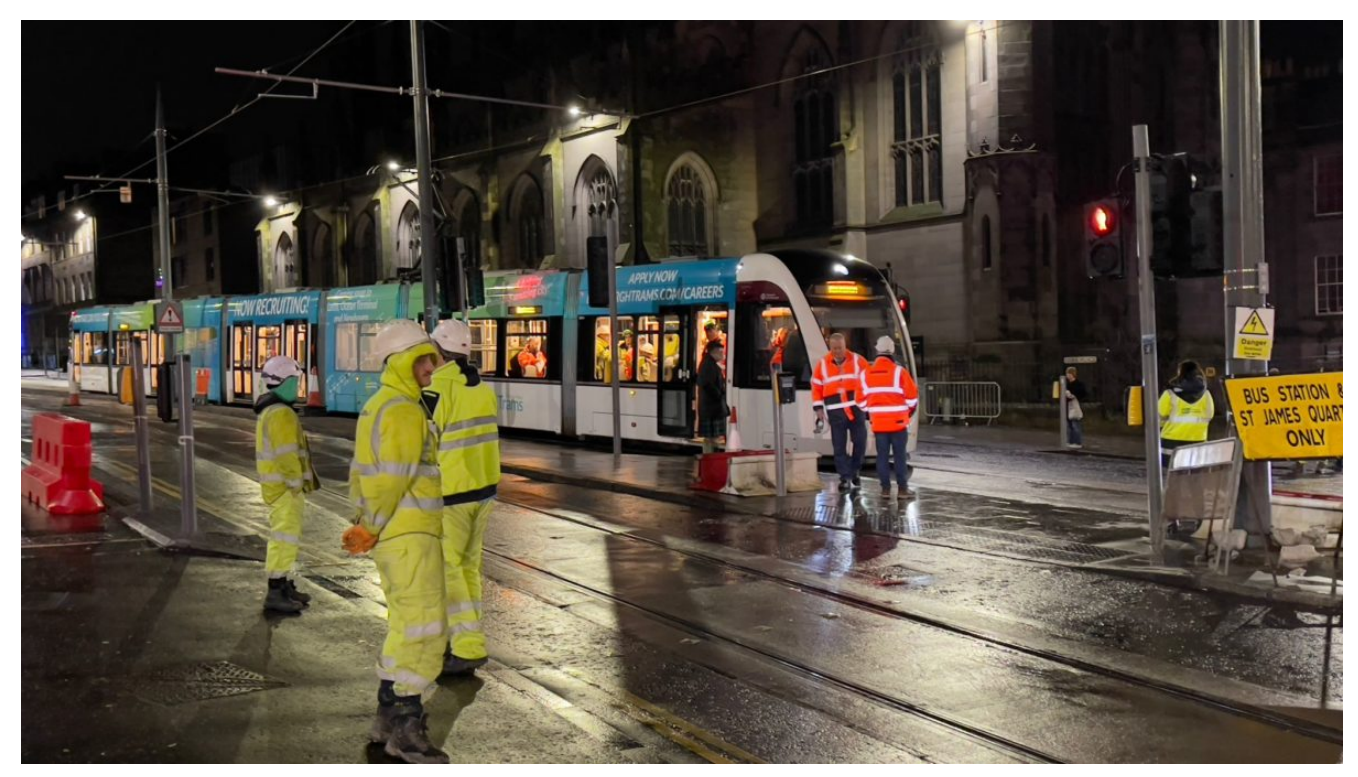
First trams since November 1956 go down Leith Walk on 13 March 2023 during testing phase