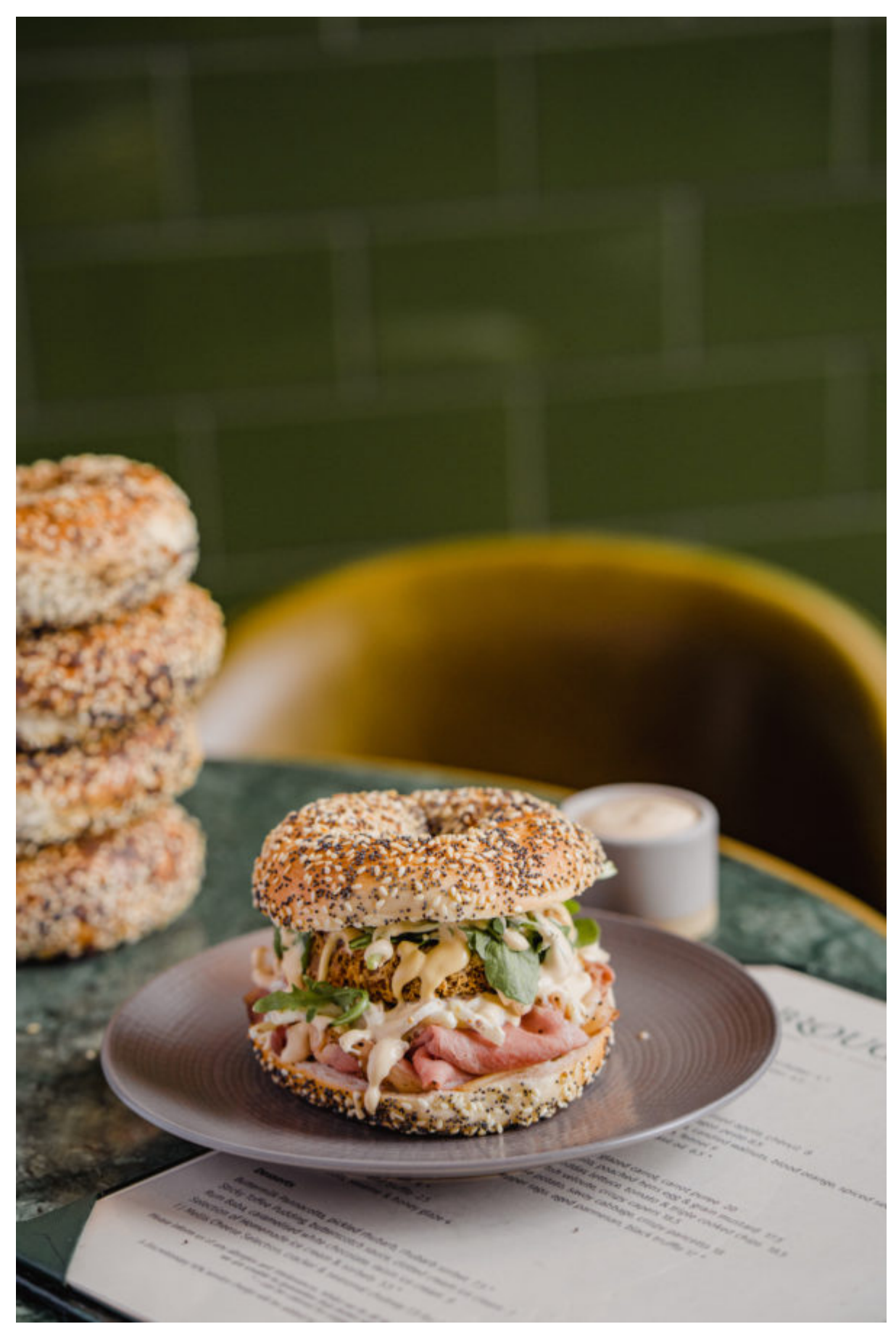
The Holey Roast from Bross Bagels and The Broughton