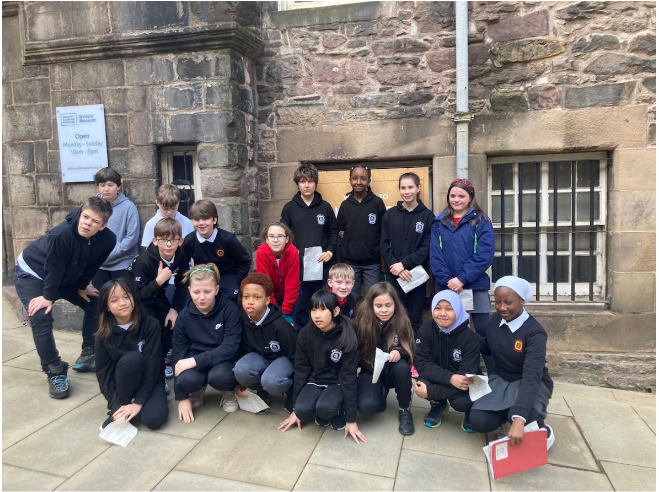
P7 pupils from Royal Mile Primary School visiting Makars' Court