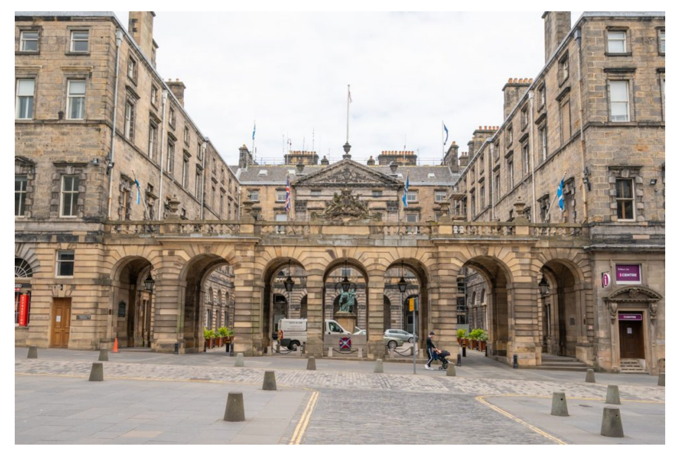
Edinburgh City Chambers.

The Local Democracy Reporting Service (LDRS) is a public service news agency. It is funded by the BBC, provided by the local news sector (in Edinburgh that is Reach plc (the publisher behind Edinburgh Live and The Daily Record) and used by many qualifying partners. Local Democracy Reporters cover news about top-tier local authorities and other public service organisations.