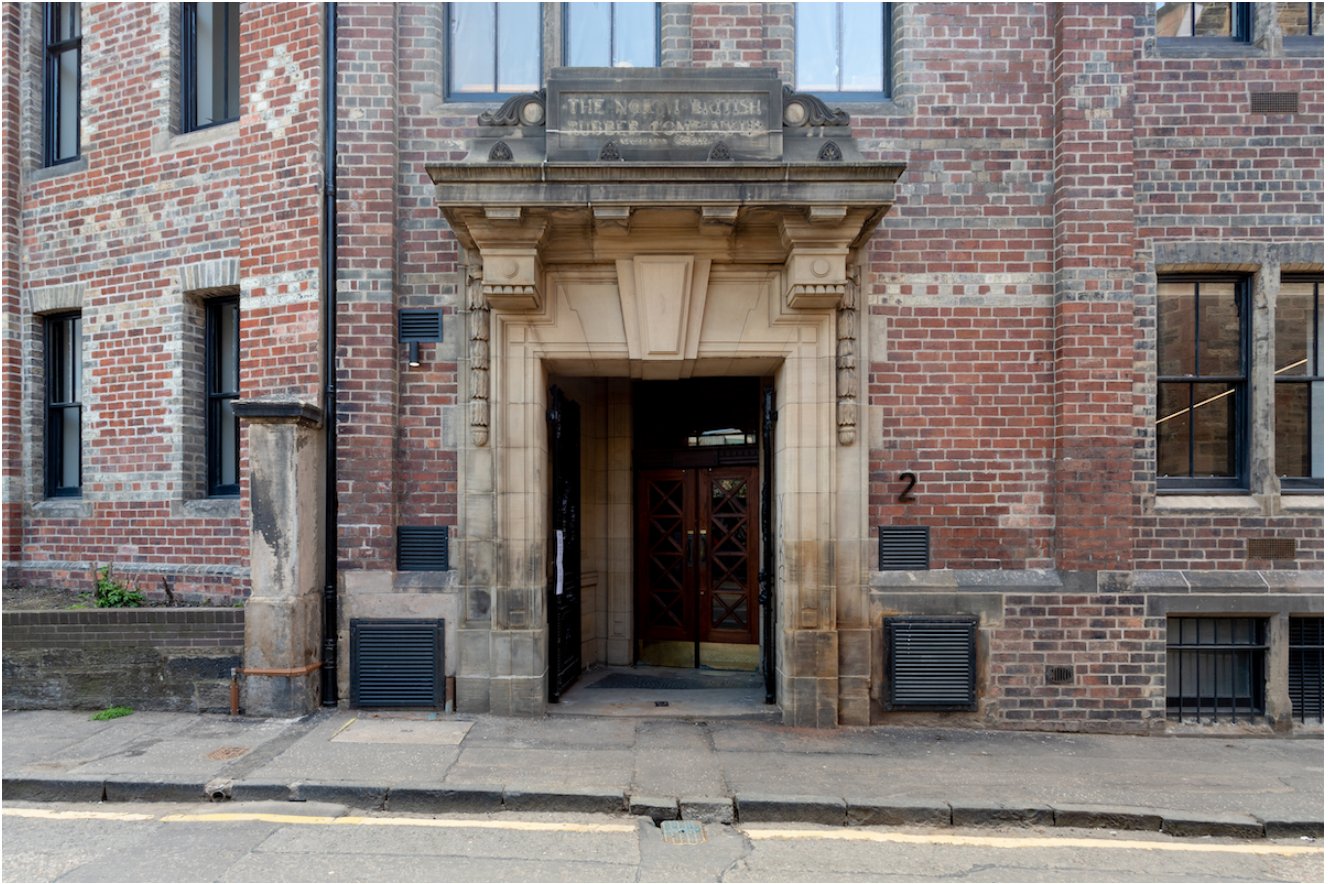
Edinburgh Printmakers