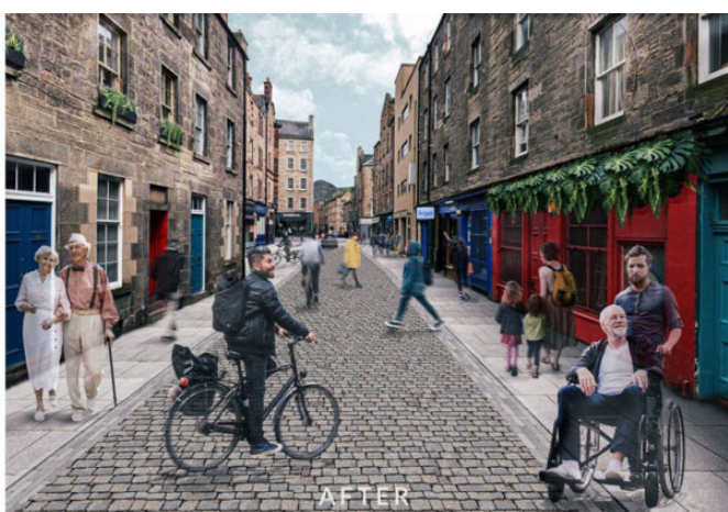
Artist's impression: Aga Mietkiewicz / Wee Dog Media