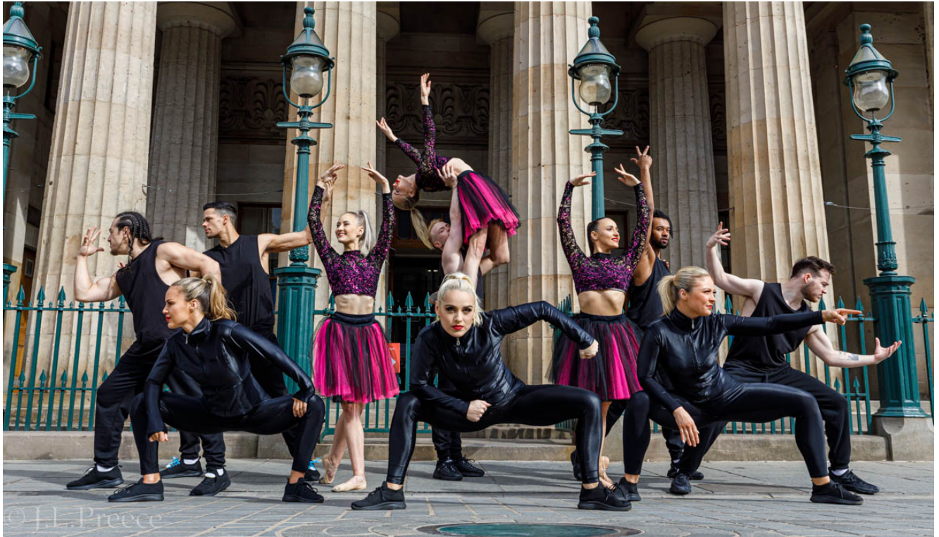
Beats on Pointe, Scottish National Gallery, Edinburgh 7th Aug 2022