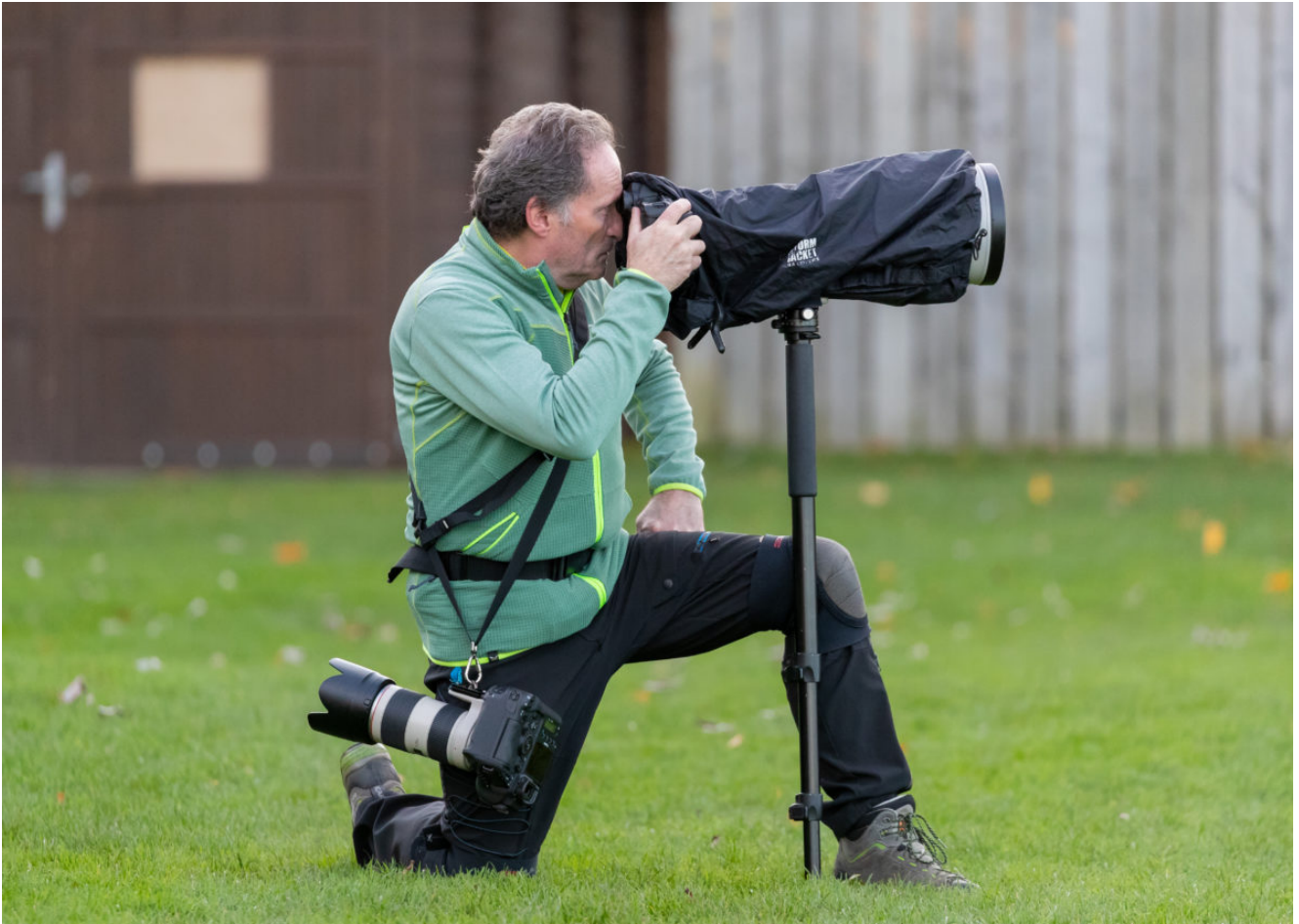
Stew Mel 1XV v Dundee RFC – Tennents Nat 1 – 12.11.22