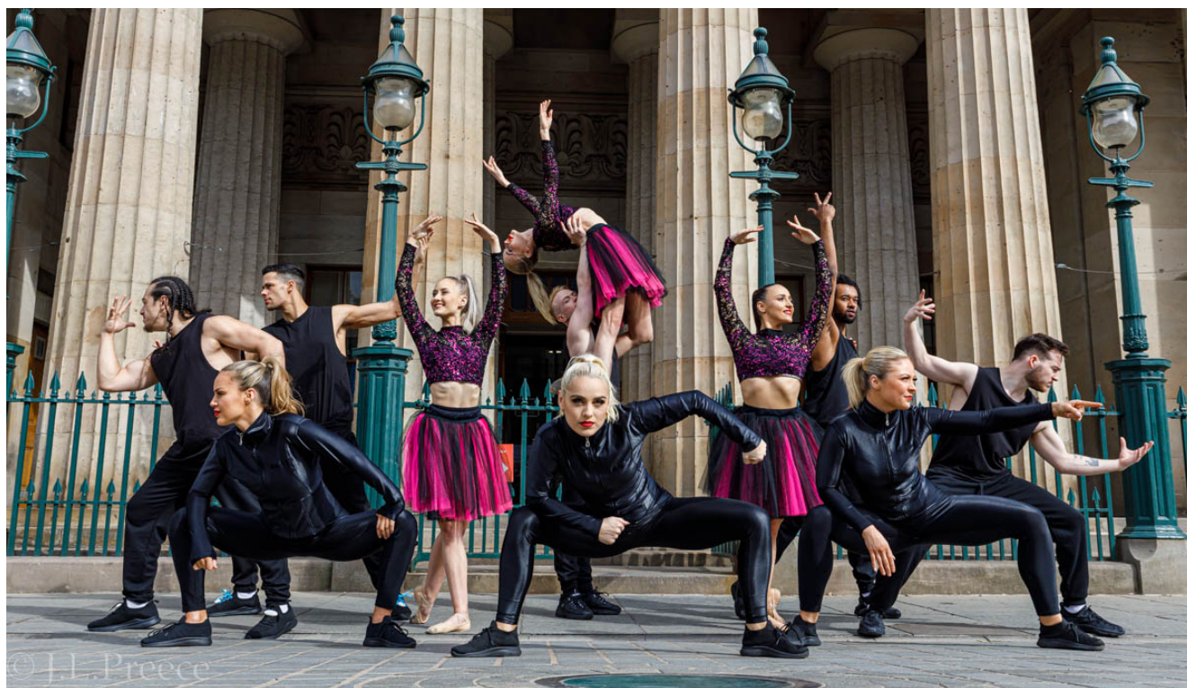
Beats on Pointe, Scottish National Gallery, Edinburgh 7th Aug 2022