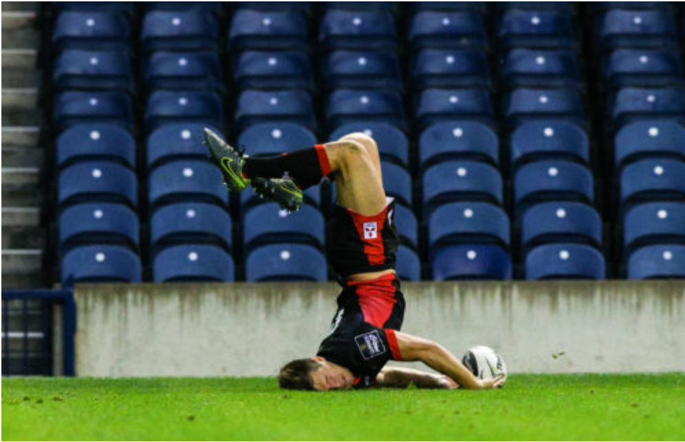
Edinburgh Rugby v Leinster Rugby, Murrayfield, Edinburgh, 16th Sept. 2016 Guinness PR012