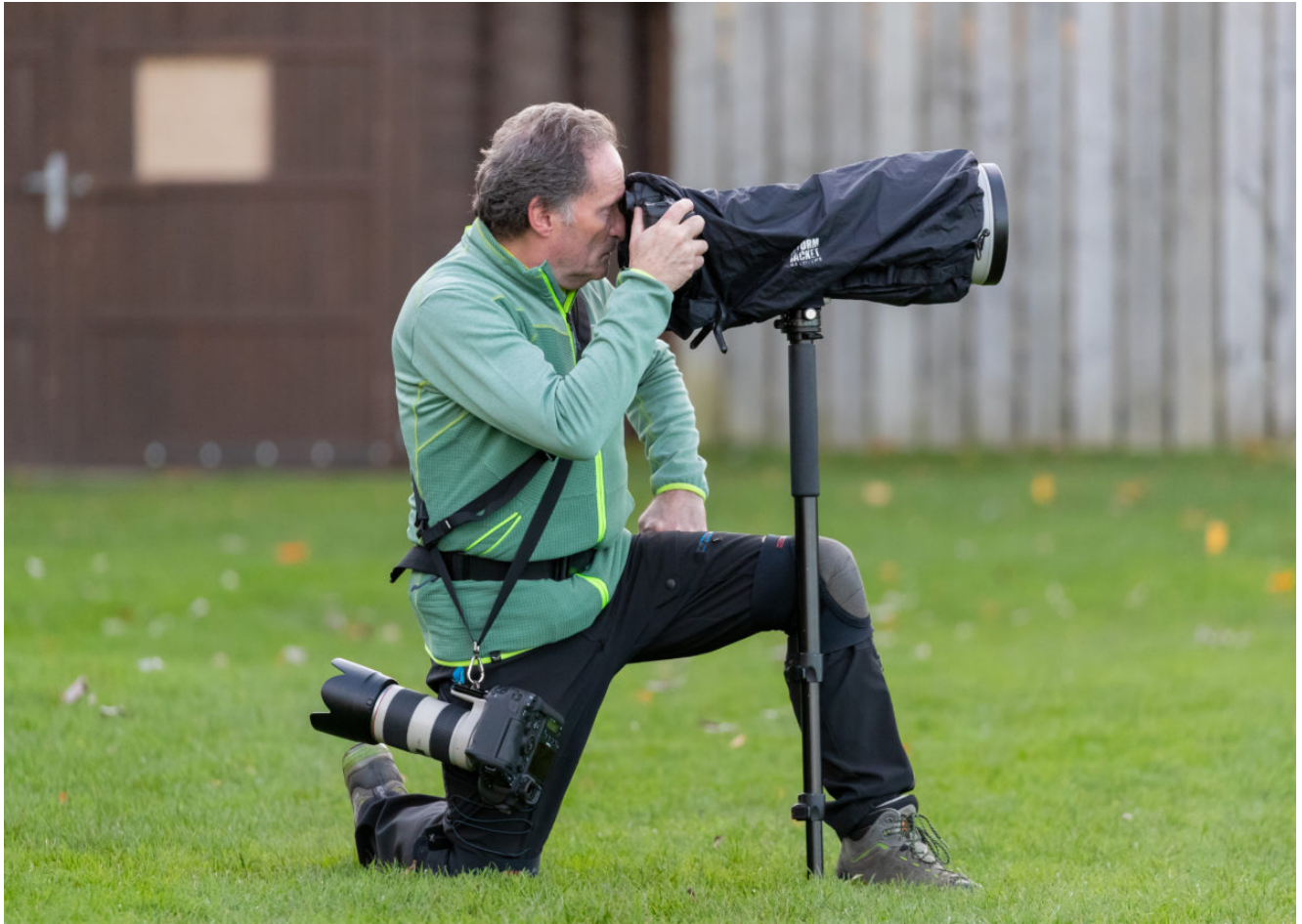
Stew Mel 1XV v Dundee RFC – Tennents Nat 1 – 12.11.22