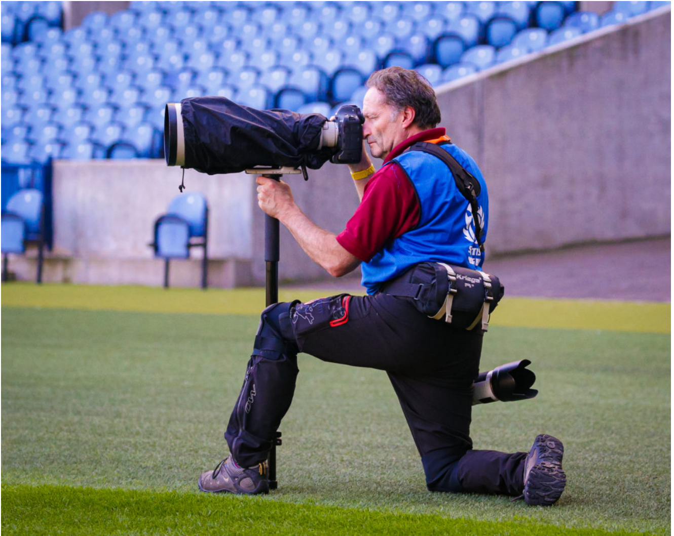
ScottishVarsity-Men-EURFCvStAndrews-210919

As a member of Linlithgow Camera Club for the last decade or so his profile there shows off some of his wit and humour.