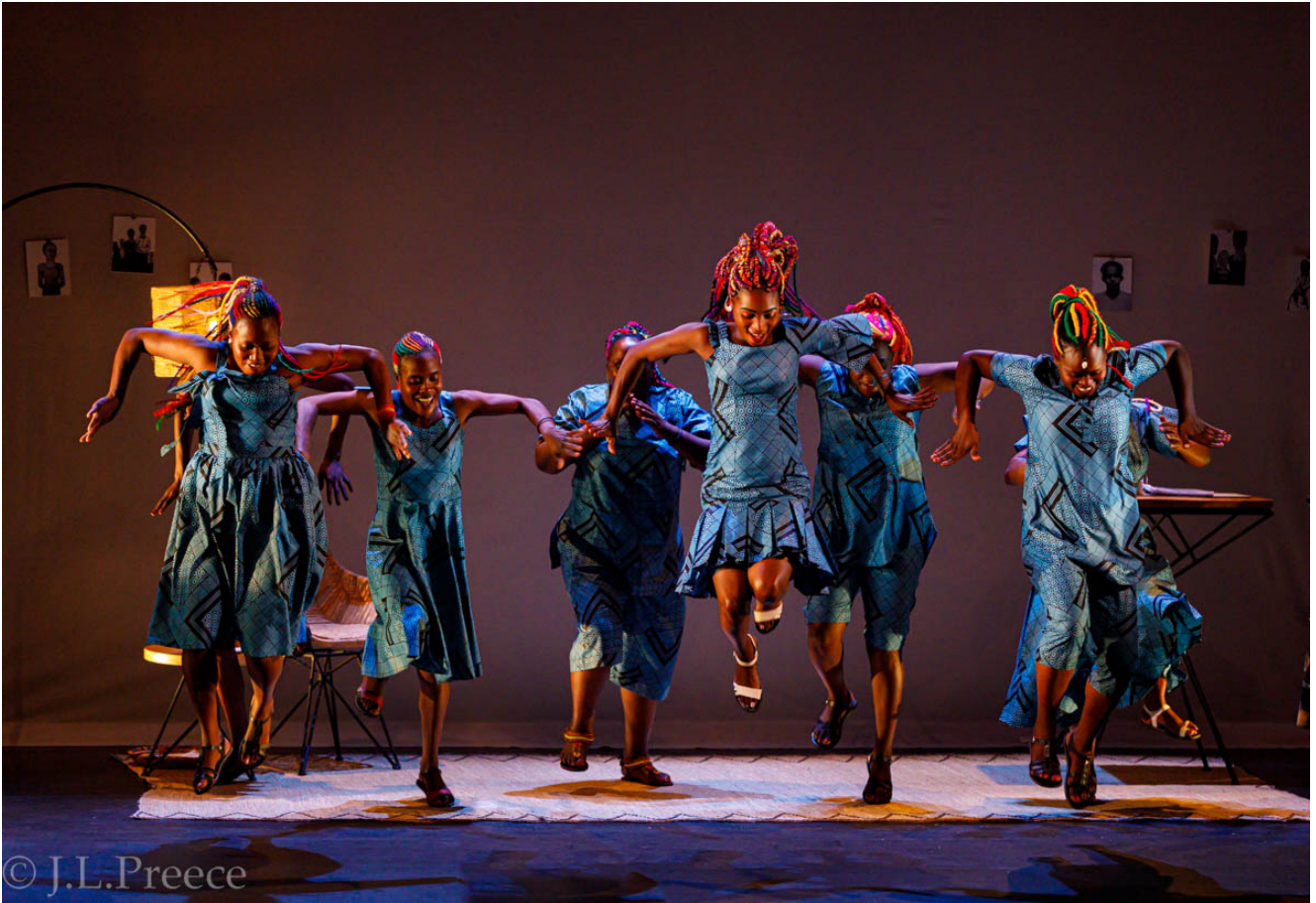
The Book of Life, Churchill Theatre, Edinburgh, 13th Aug 2022