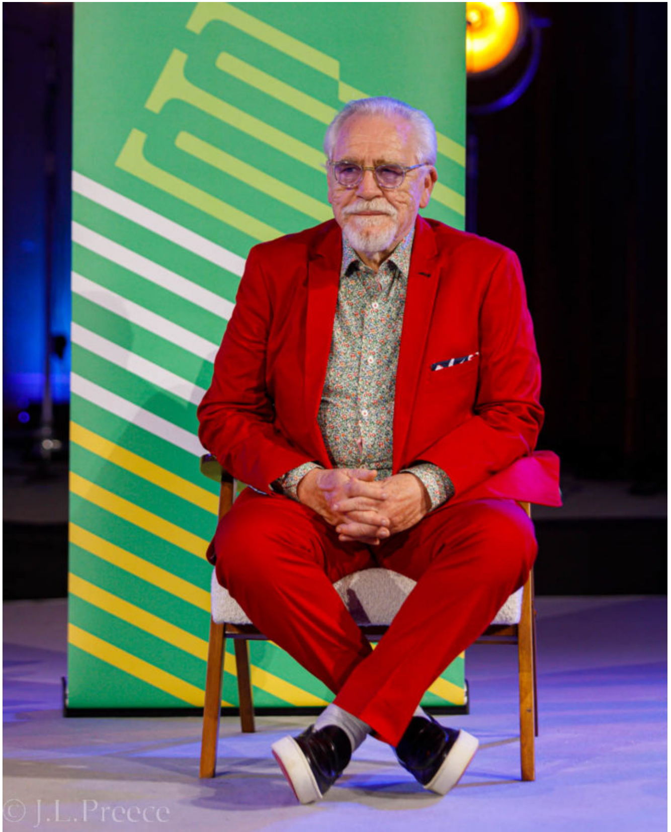
Brian Cox – Edinburgh International Book Festival – Day 17, Edinburgh School of Art, 29th Aug 2022