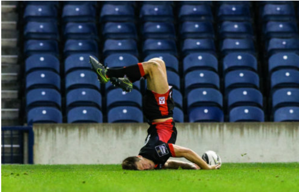
Edinburgh Rugby v Leinster Rugby, Murrayfield, Edinburgh, 16th Sept. 2016 Guinness PR012