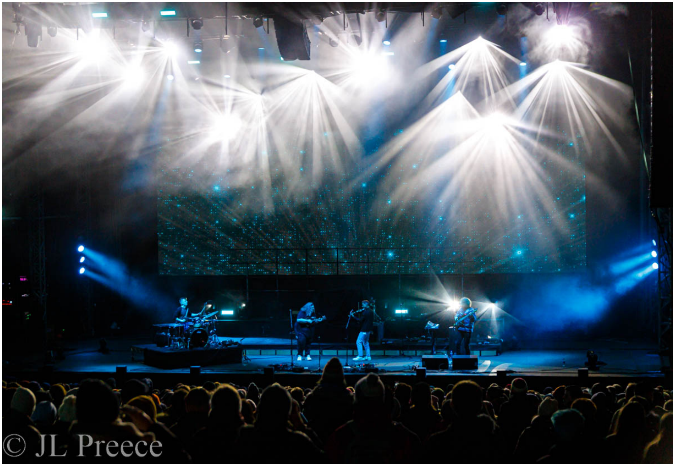
Final Fling, Princes Street Gdns, Edinburgh, 1st Jan 2023