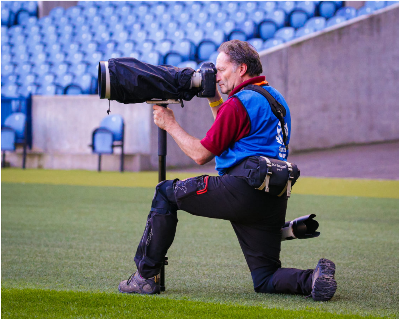
ScottishVarsity-Men-EURFCvStAndrews-210919

As a member of Linlithgow Camera Club for the last decade or so his profile there shows off some of his wit and humour.