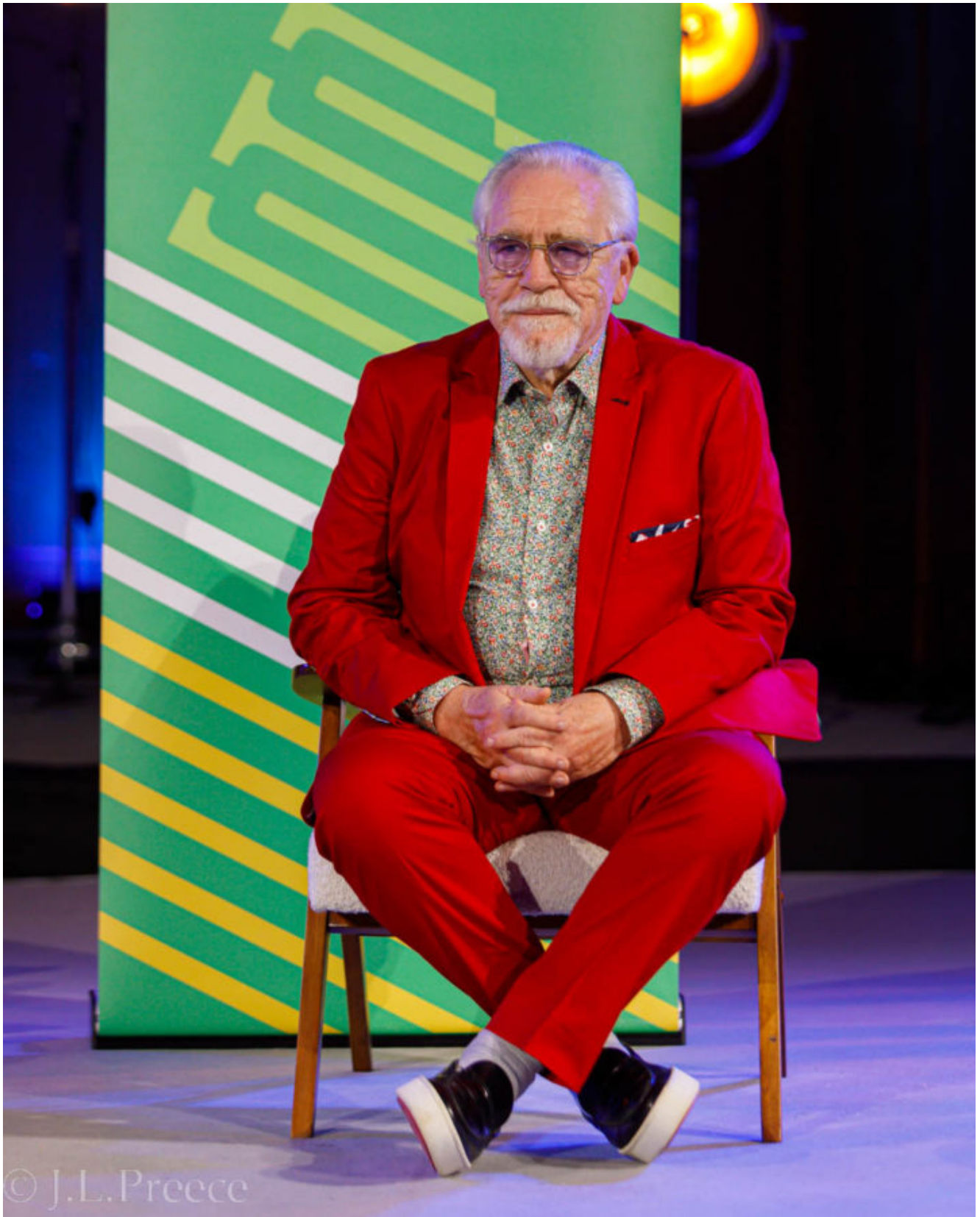
Brian Cox – Edinburgh International Book Festival – Day 17, Edinburgh School of Art, 29th Aug 2022