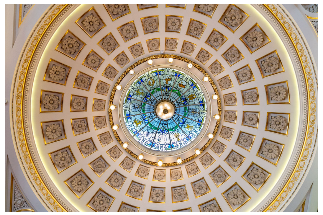
Possibly the main view for a lot of councillors today during what is expected to be a lengthy council meeting