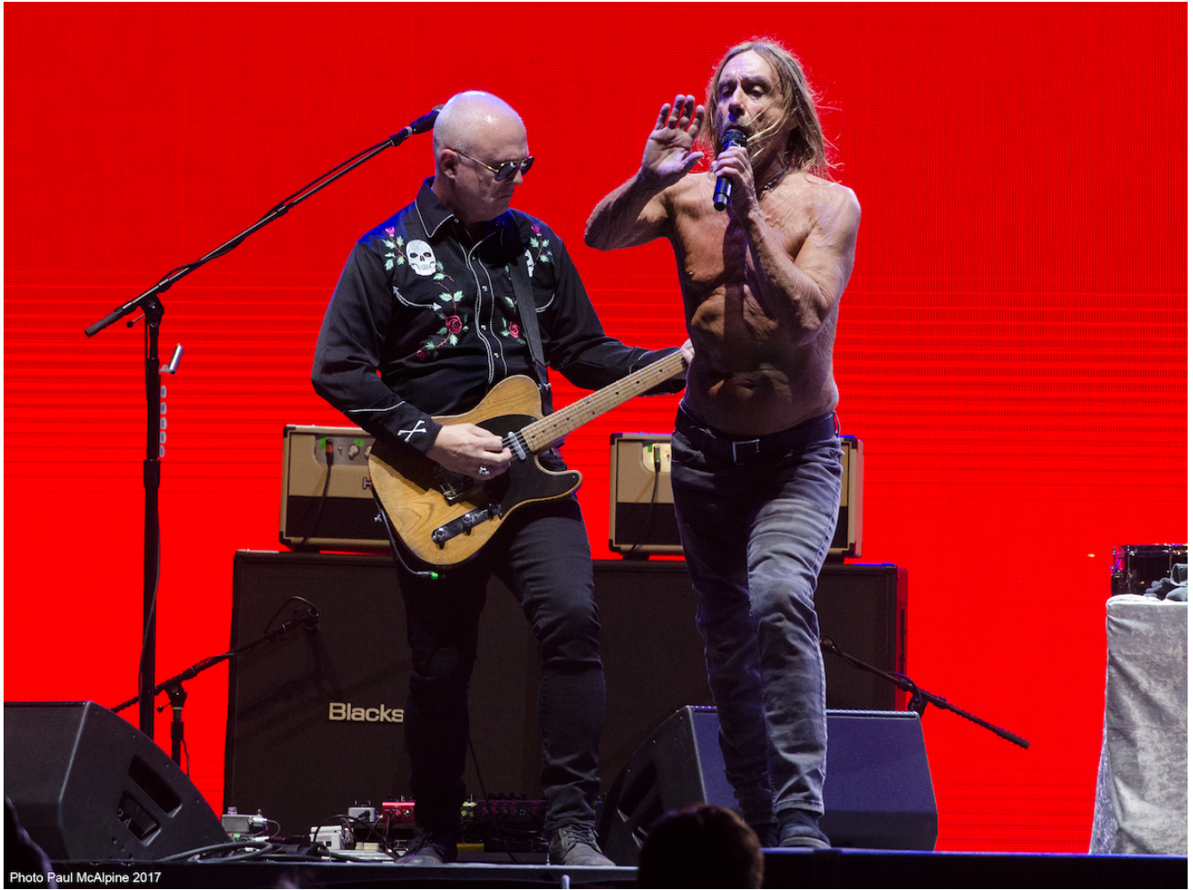
Kevin Armstrong with Iggy Pop