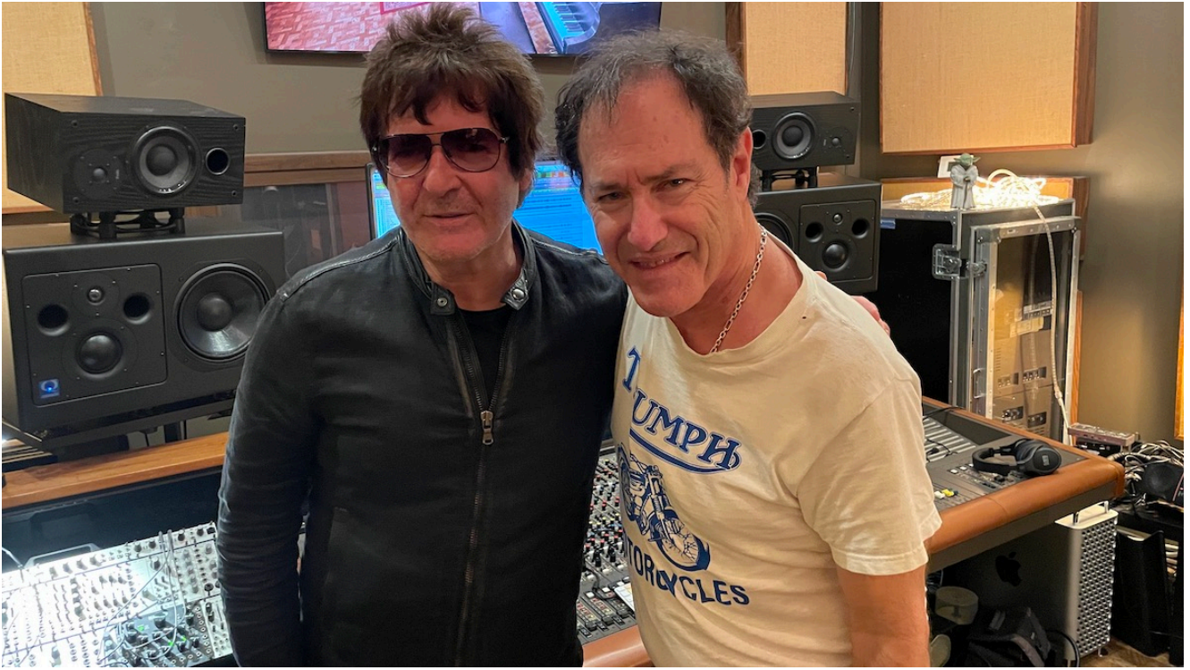
Clem Burke and Tony Sales