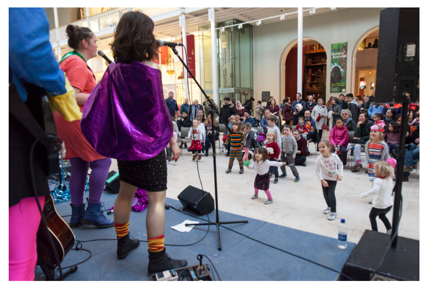
Sprogmanay