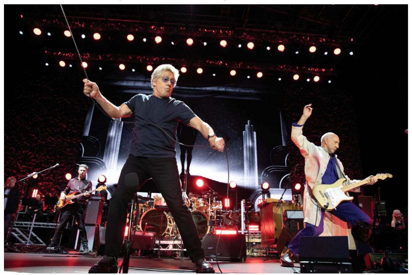
The Who perform at Wembley Stadium in Wembley, England as part of The Who's Moving On Tour in July 4, 2019.