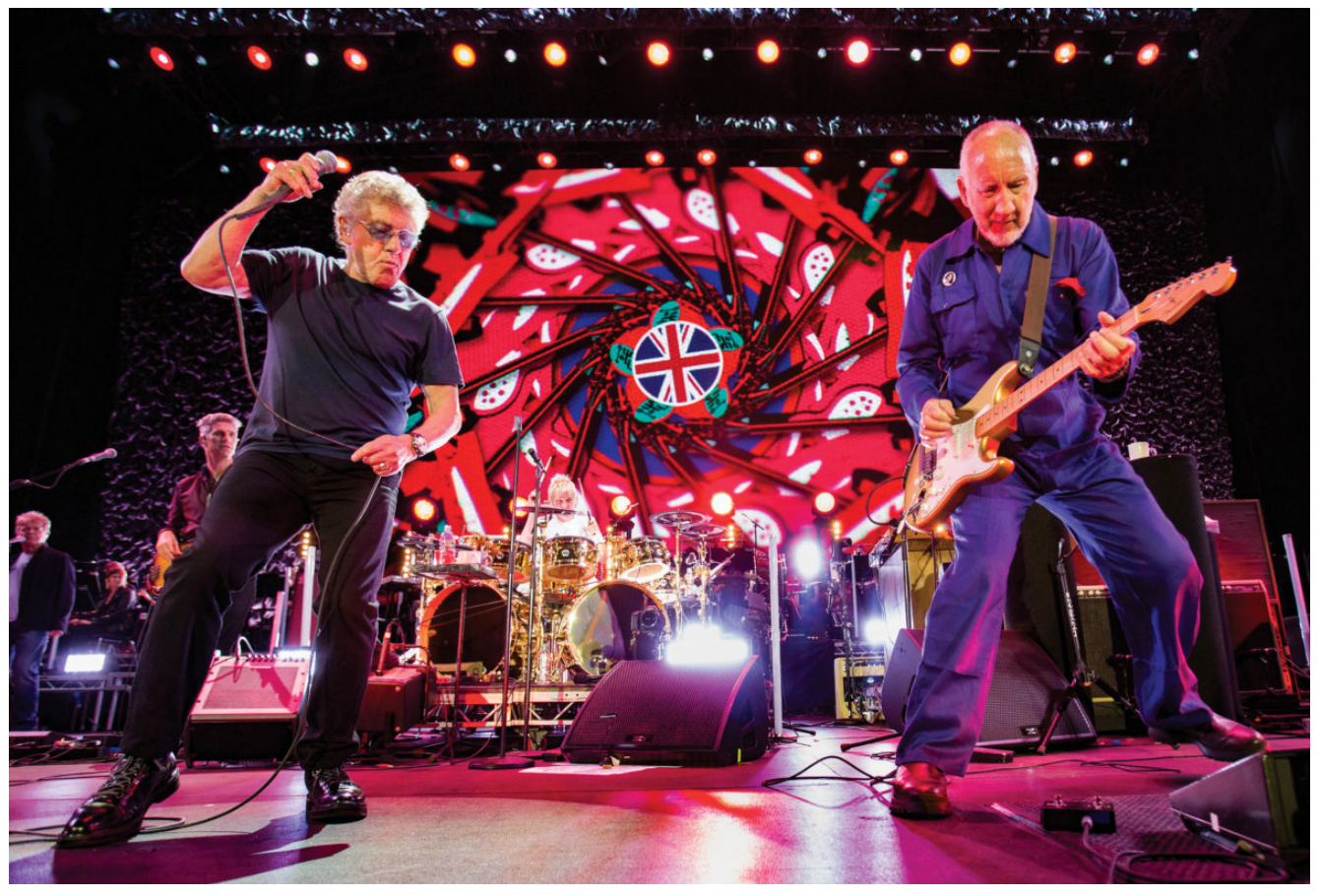
The Who perform at Wembley Stadium in Wembley, England as part of The Who's Moving On Tour in July 4, 2019.