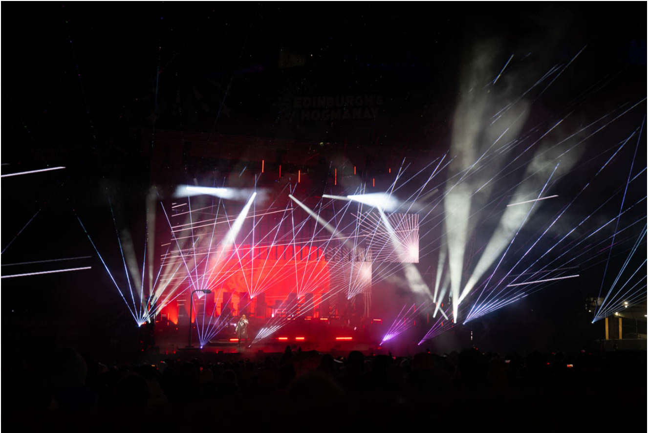
Edinburgh's Hogmanay to see in the New Year included fabulous entertainment from The Pet Shop Boys