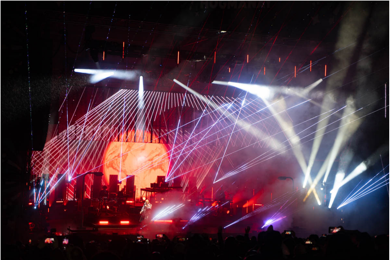
Edinburgh's Hogmanay to see in the New Year included fabulous entertainment from The Pet Shop Boys