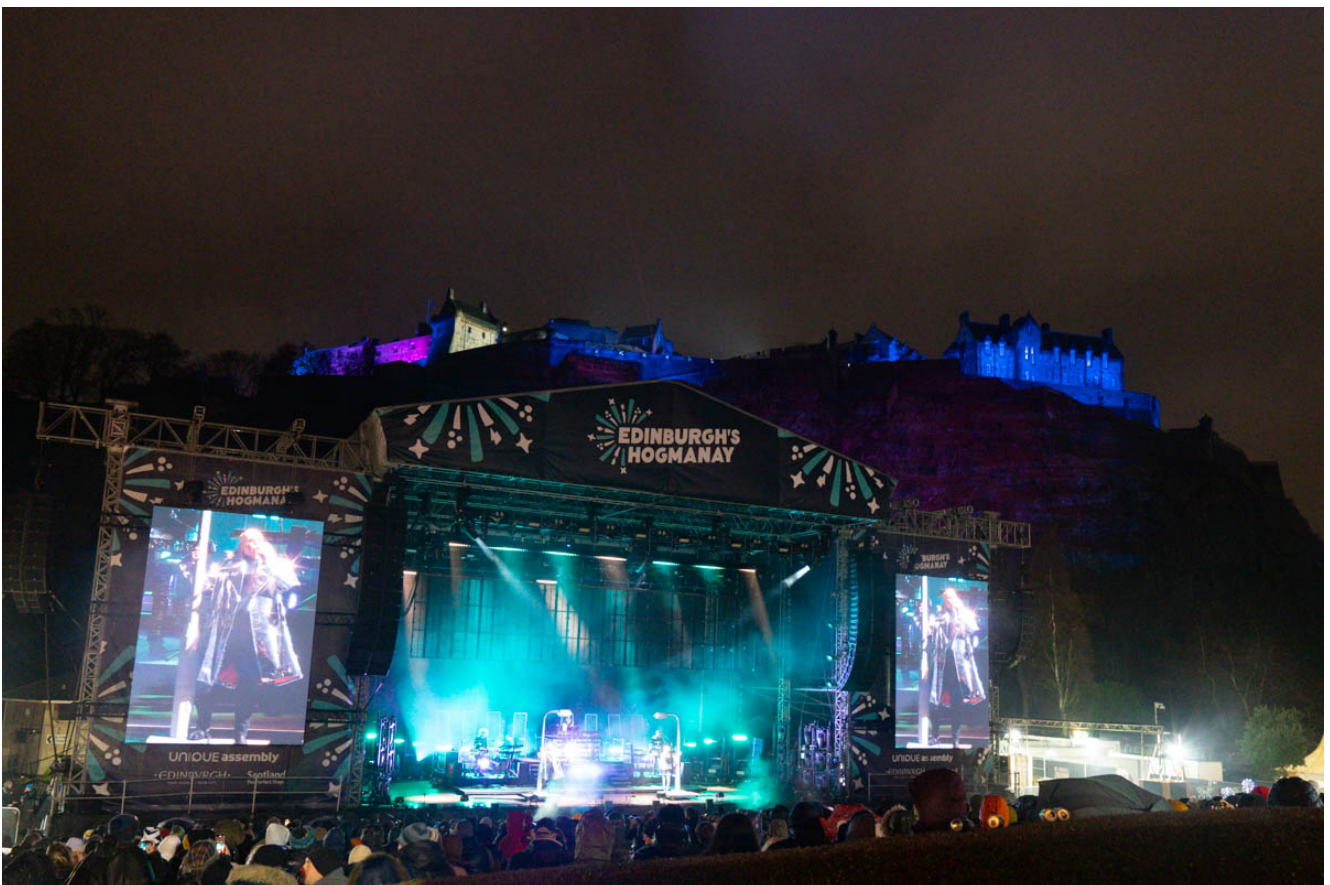
Edinburgh's Hogmanay to see in the New Year included fabulous