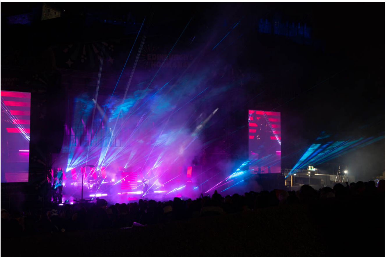
Edinburgh's Hogmanay to see in the New Year included fabulous