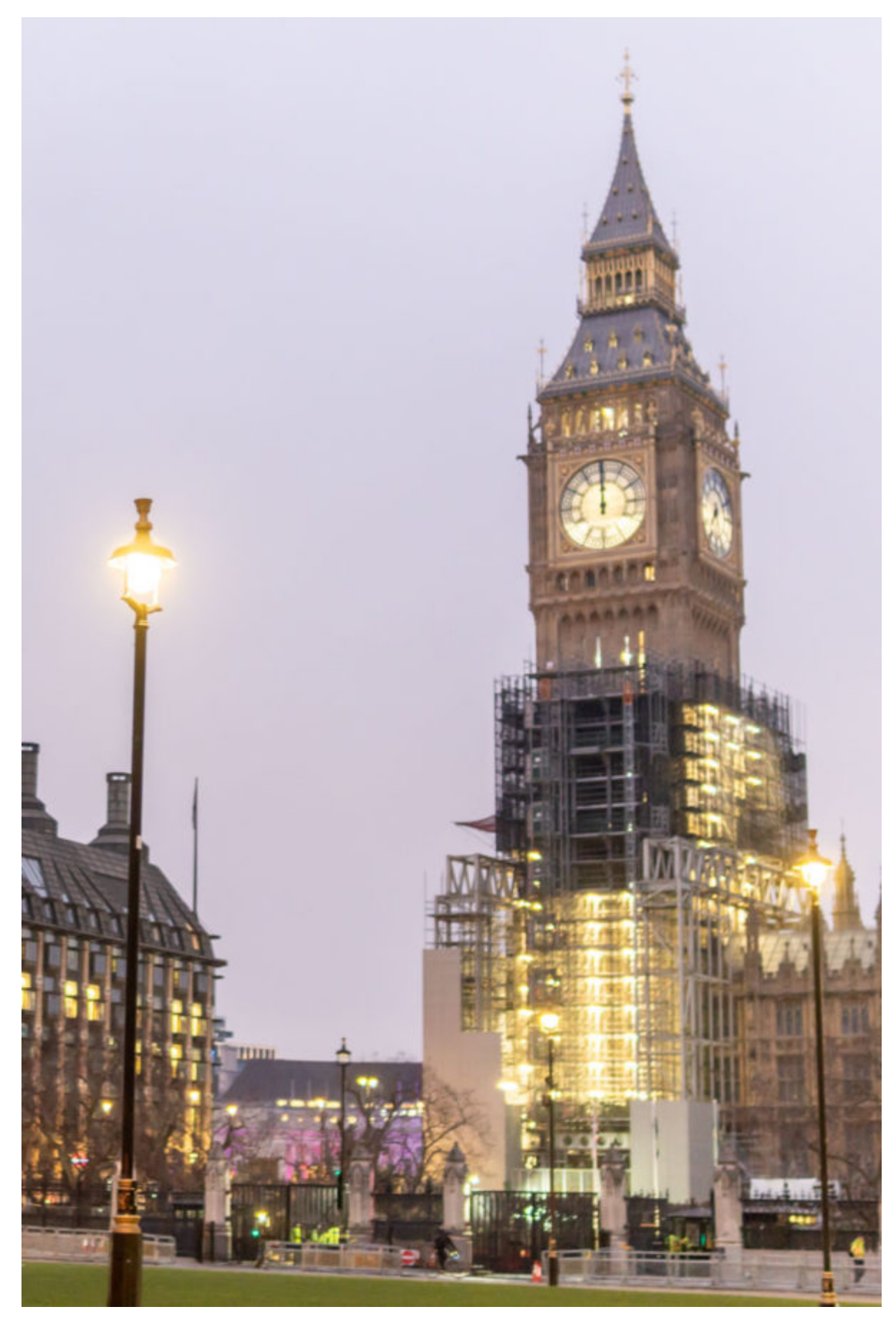
The SNP report that they will table a motion in the House of Commons to stop the UK Government from using Section 35 of the