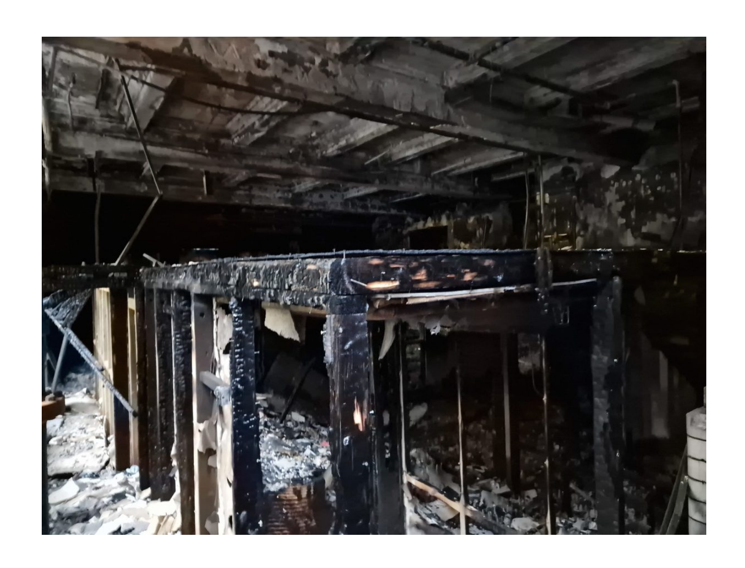
Burns on a Budget