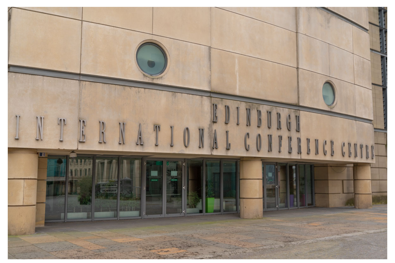
Edinburgh International Conference Centre used the EICC as a mass vaccination centre.