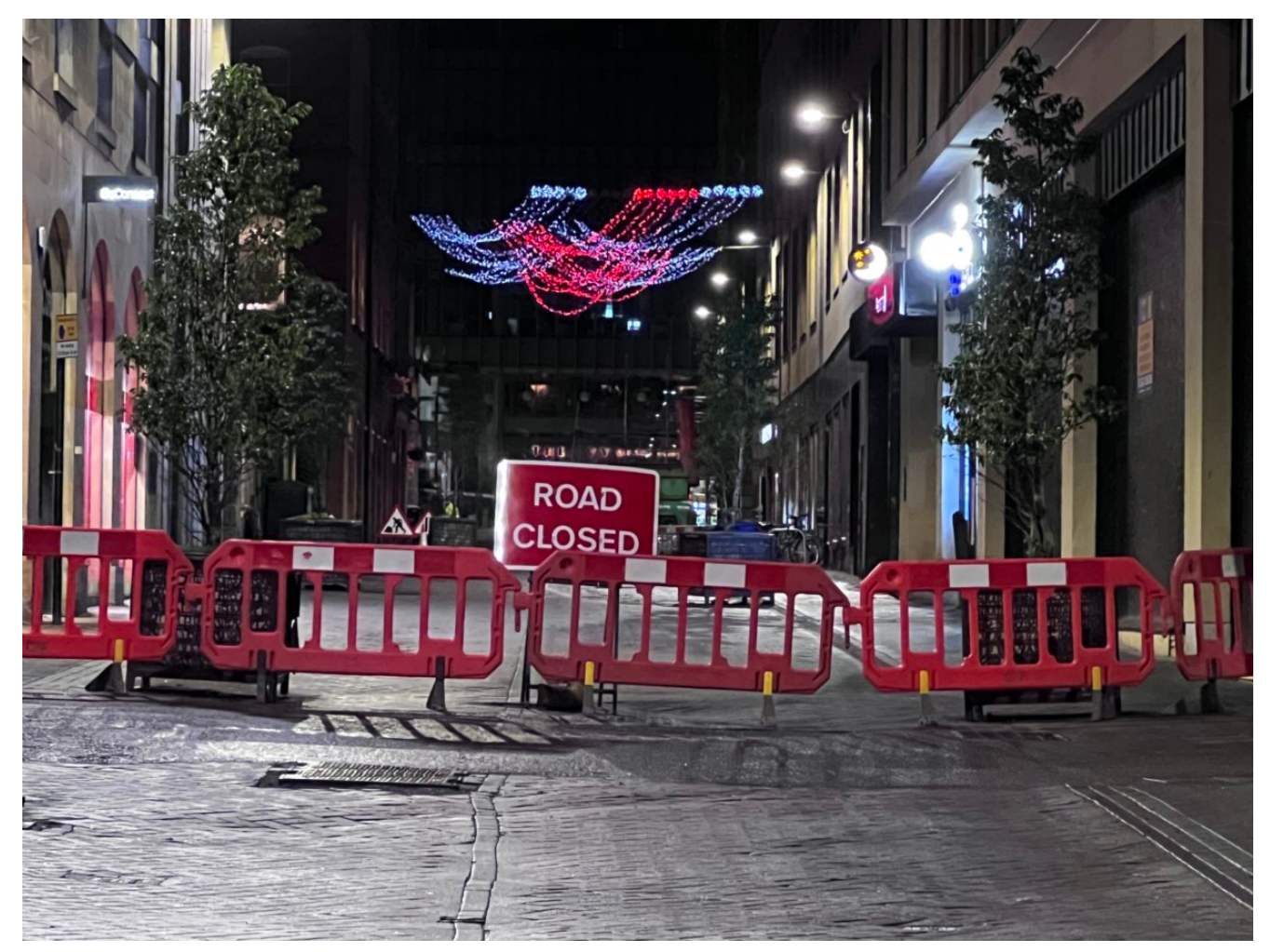
Rose Street behind Jenner's remained closed on Monday evening.