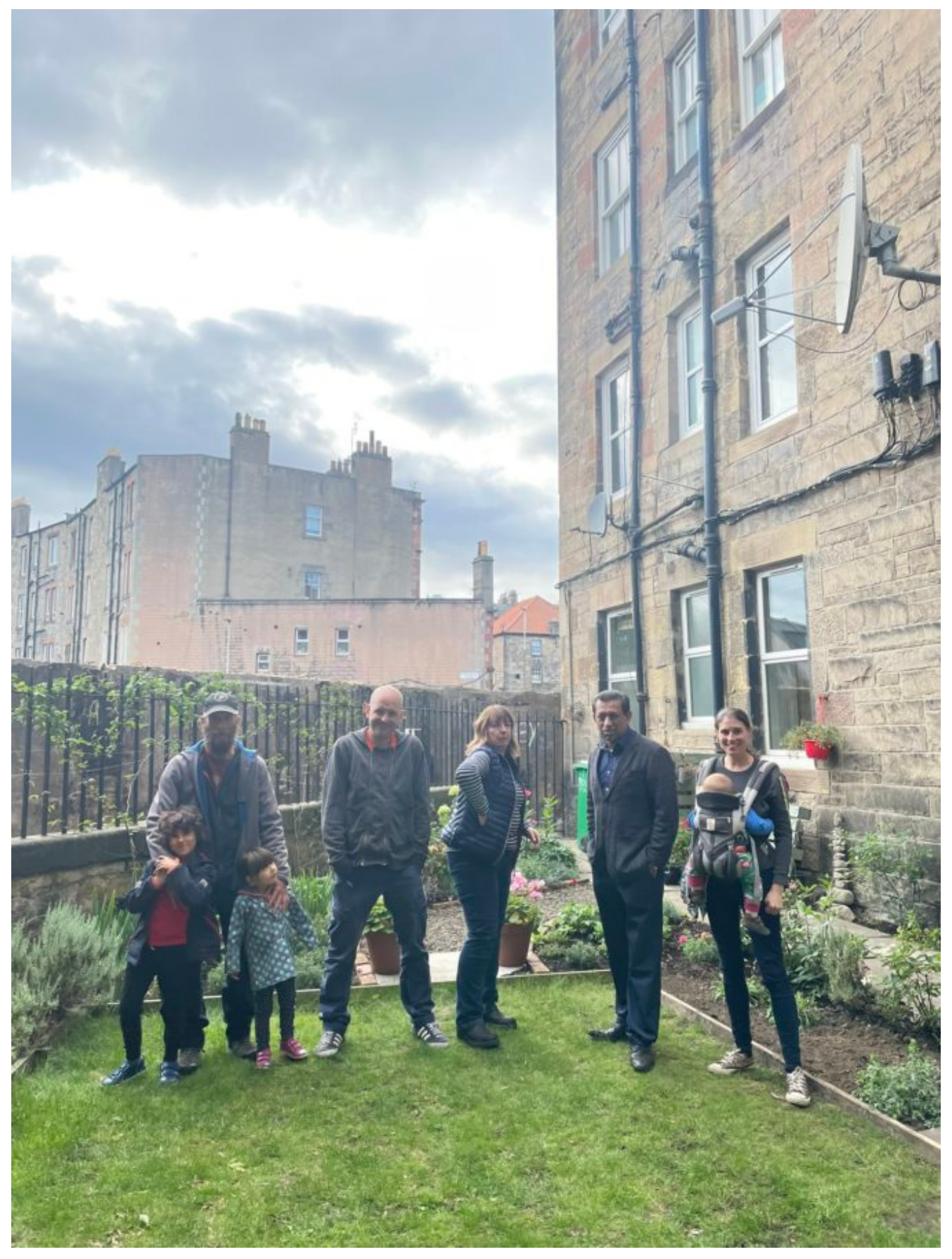
Some of the many residents who object to the development met Foysol Choudhury MP who supports their campaign