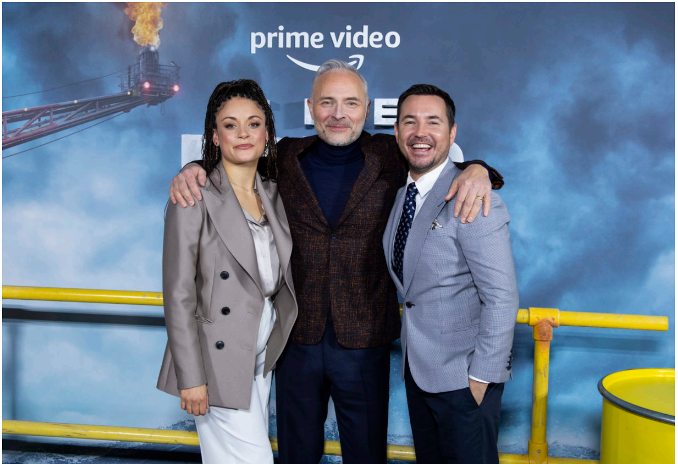
Rochenda Sandall, Mark Bonnar and Martin Compston pictured at a screening event for The Rig , at the Everyman, Edinburgh ahead of its launch on Friday 6th January worldwide