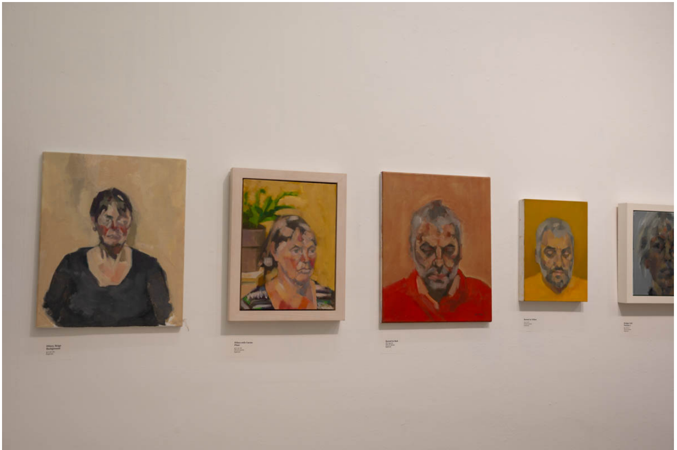
A major retrospective exhibition of work by Bridget Ievers Cox is open at Summerhall until 5 March 2023