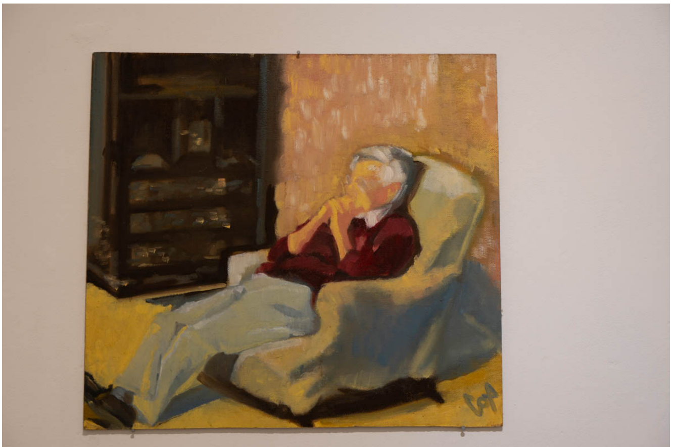
A major retrospective exhibition of work by Bridget Ievers Cox