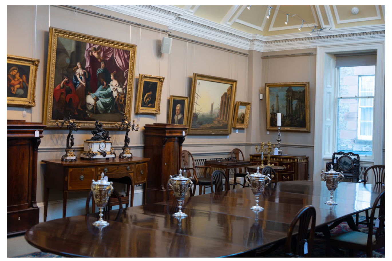
Bonhams will sell the contents of Meldon Hall and a Highland Estate house on 2 February