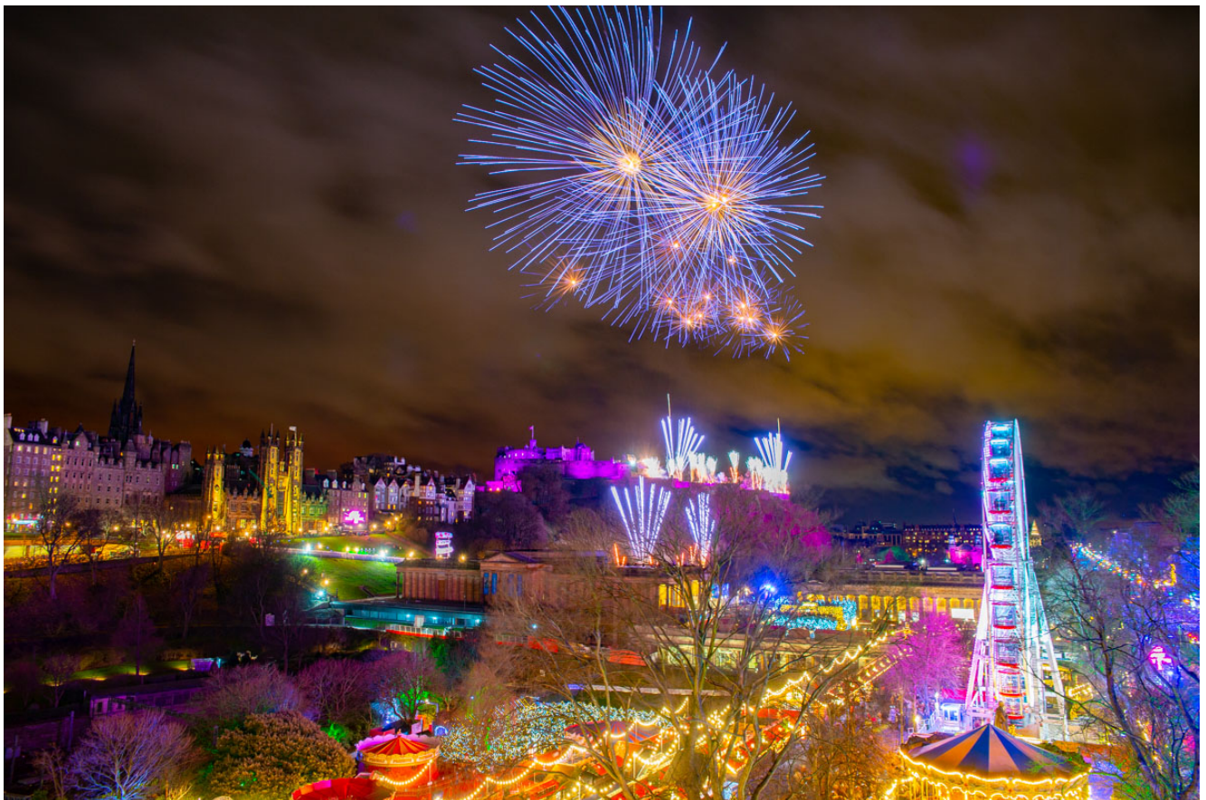
Edinburgh Castle Fireworks Hogmanay 2018

If it is Edinburgh's Hogmanay you are after with the Pet Shop Boys and many other events on the days before and after the final day of 2022 then click here .