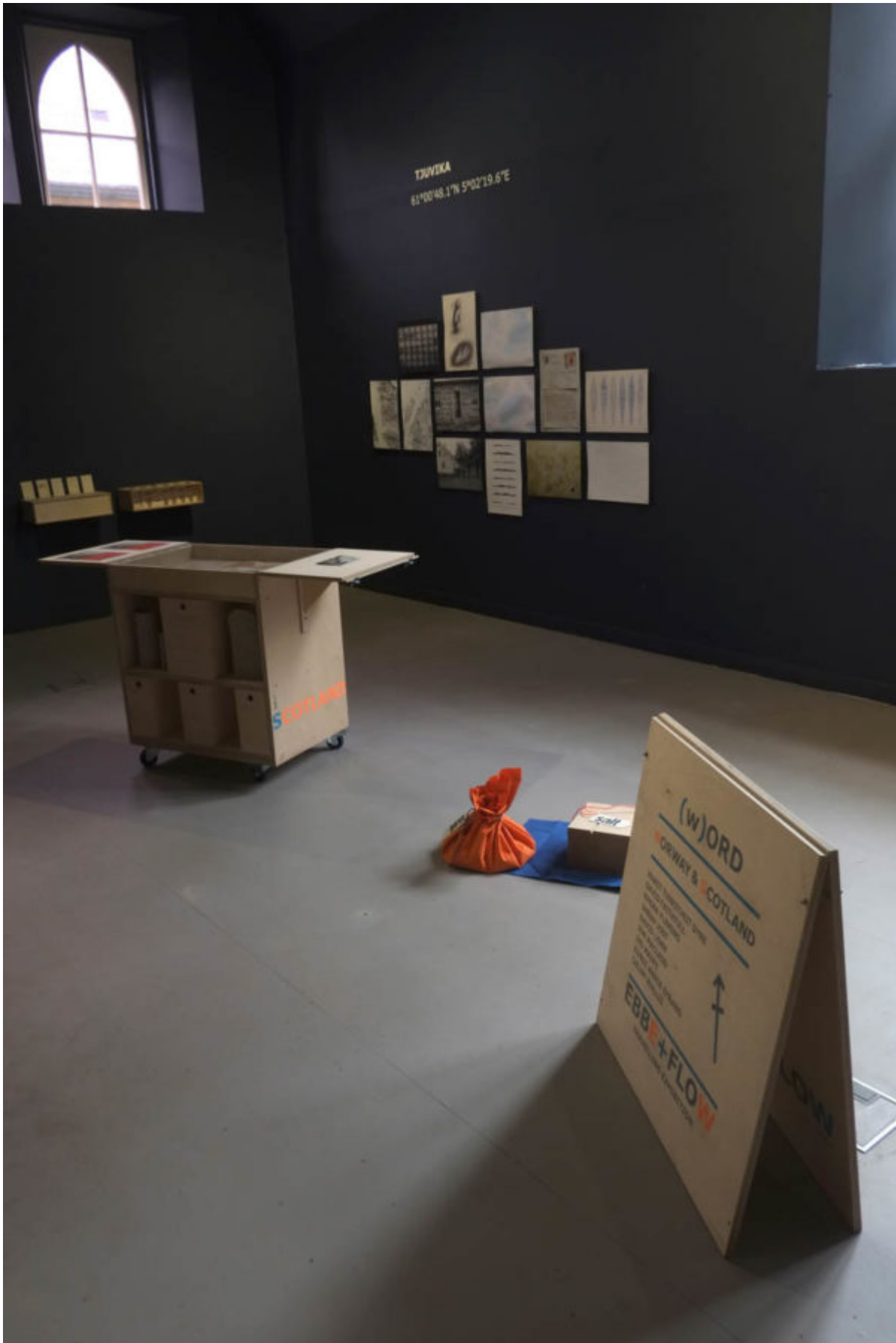
EBBE + FLOW

Upon entering the RSA, visitors can also look forward to