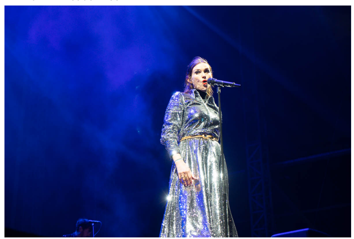
The entertainment at the Night Afore Party in Princes Street Gardens was provided by Clare Grogan and Altered Images