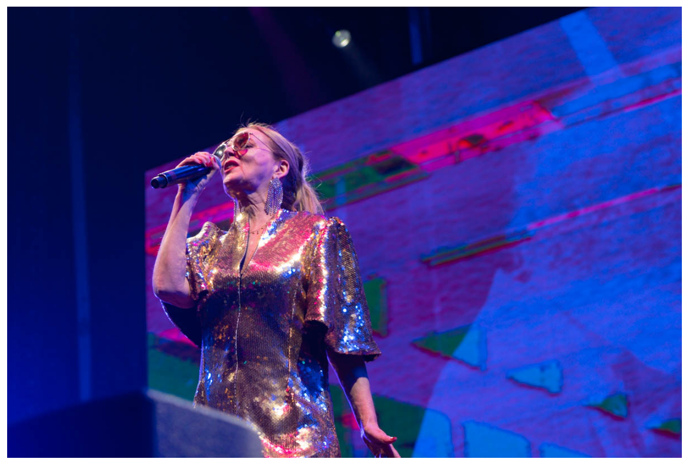
The entertainment at the Night Afore Party in Princes Street Gardens was provided by Clare Grogan (above) and Altered