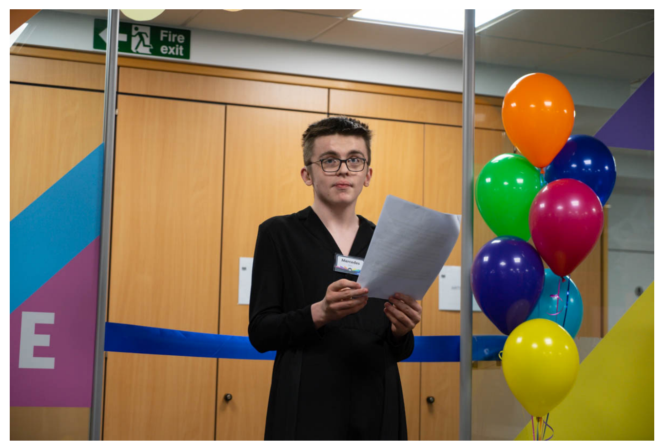
Mercedes making a speech at the official opening of Teens+ new premises at Eskmills