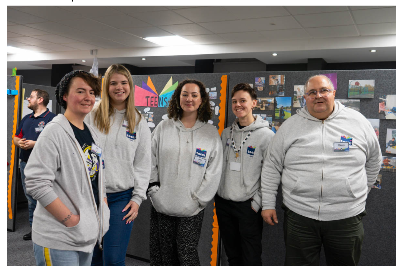
Members of staff at The official opening of Teens+ new premises at Eskmills