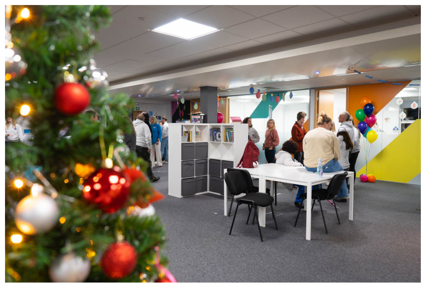
Teens+ new premises at Eskmills