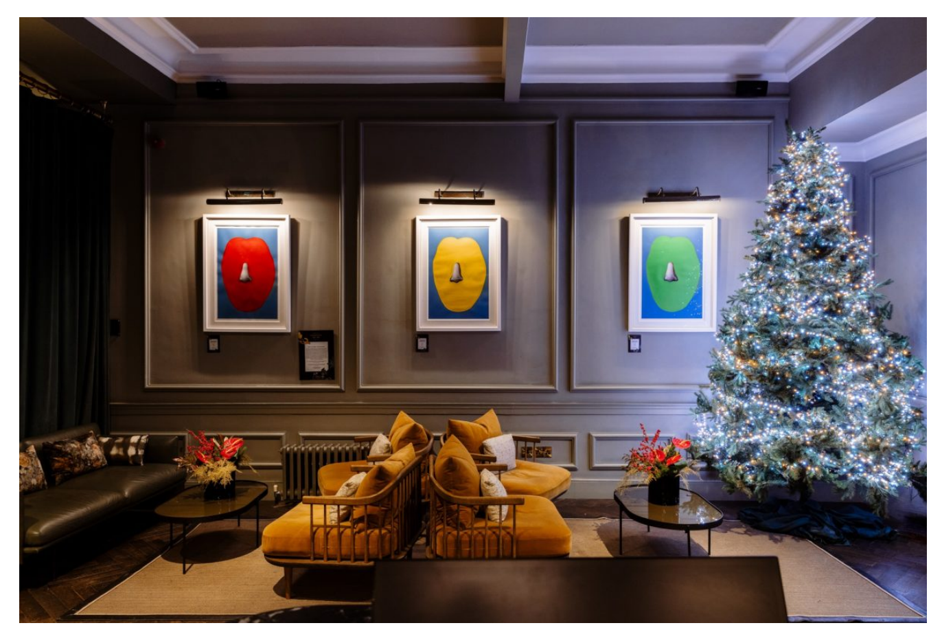
Inside the Kimpton Hotel