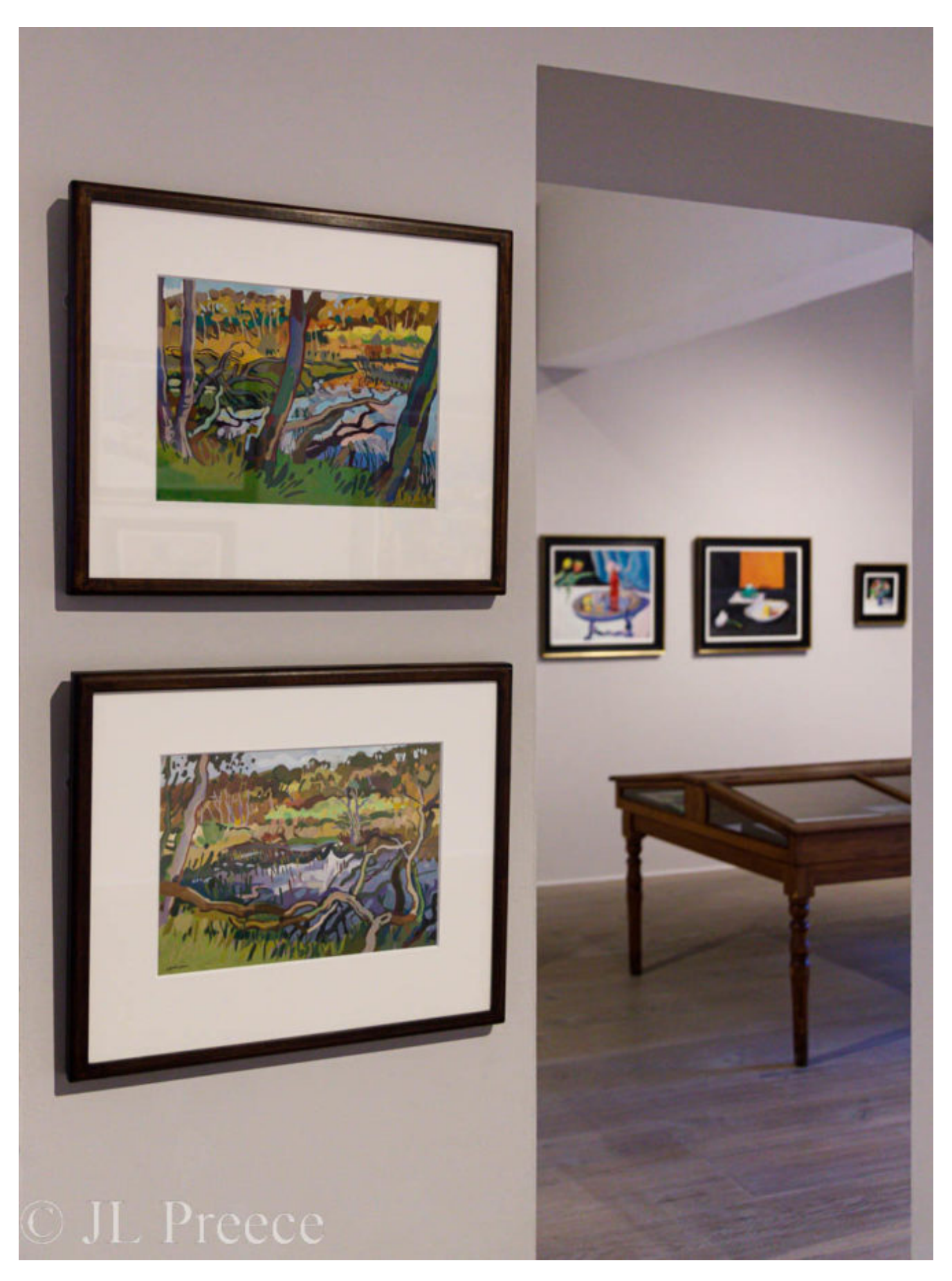
'Painting Paradise' is divided into five sections. First, the results of a short residency in the New Town of Edinburgh that produced an elegant series of architectural interiors. A