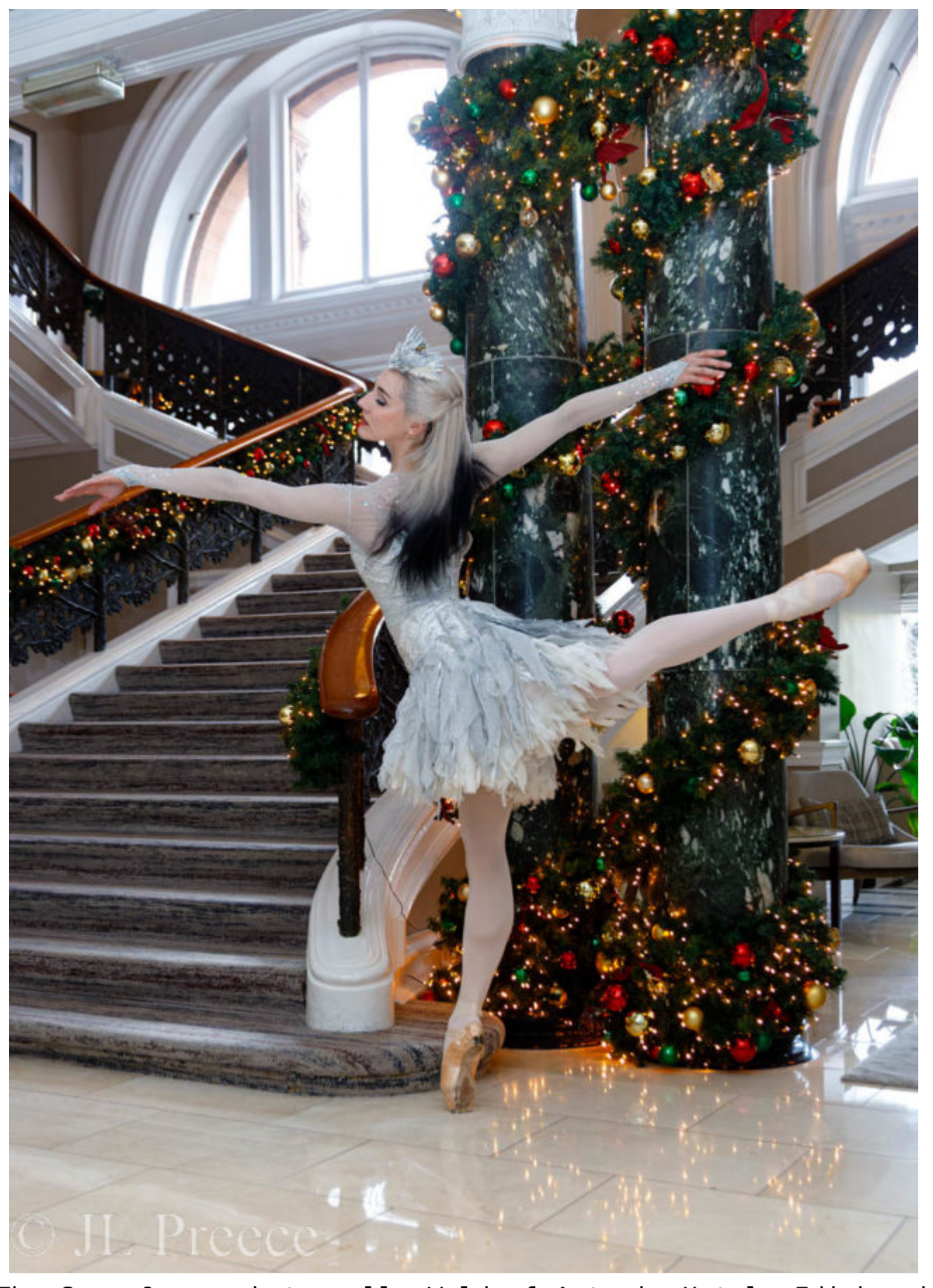
The Snow Queen photo call, Waldorf Astoria Hotel, Edinburgh, 22nd Nov 2022