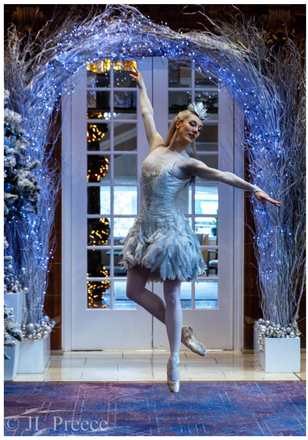
The Snow Queen photo call, Waldorf Astoria Hotel, Edinburgh, 22nd Nov 2022