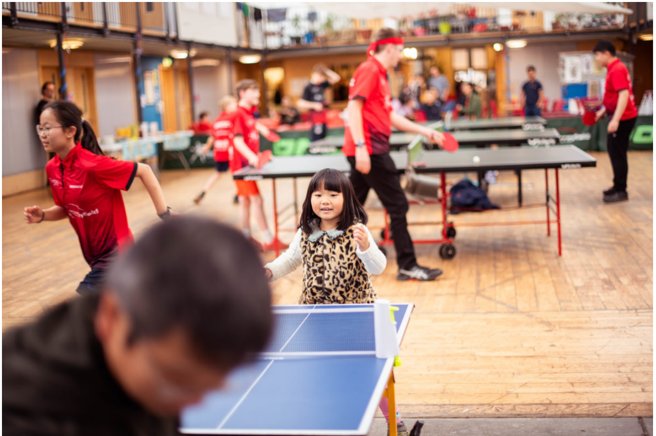
Junior coaching.