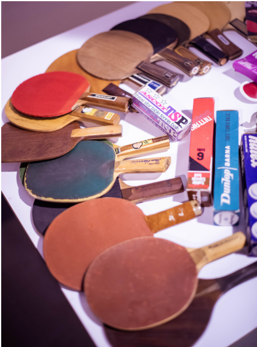
Vintage table tennis equipment.