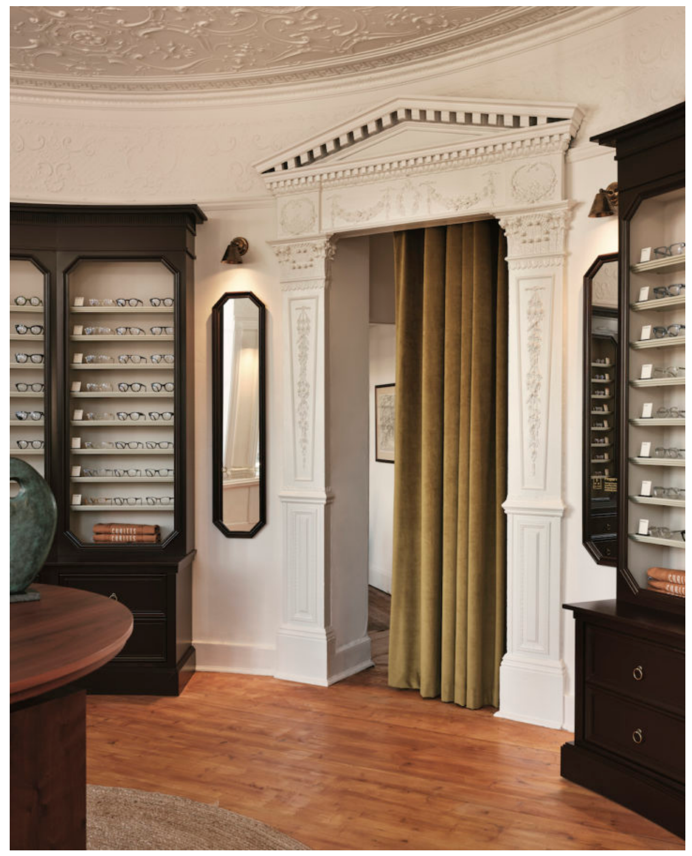
Cubitts in York Place