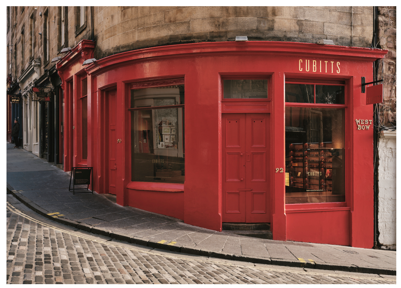
Cubitts Old Town