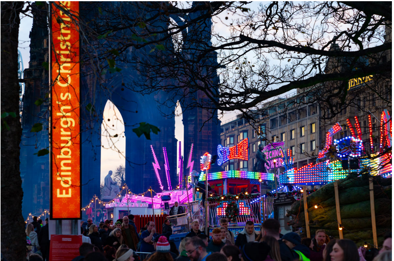
Edinburgh Christmas 2022.