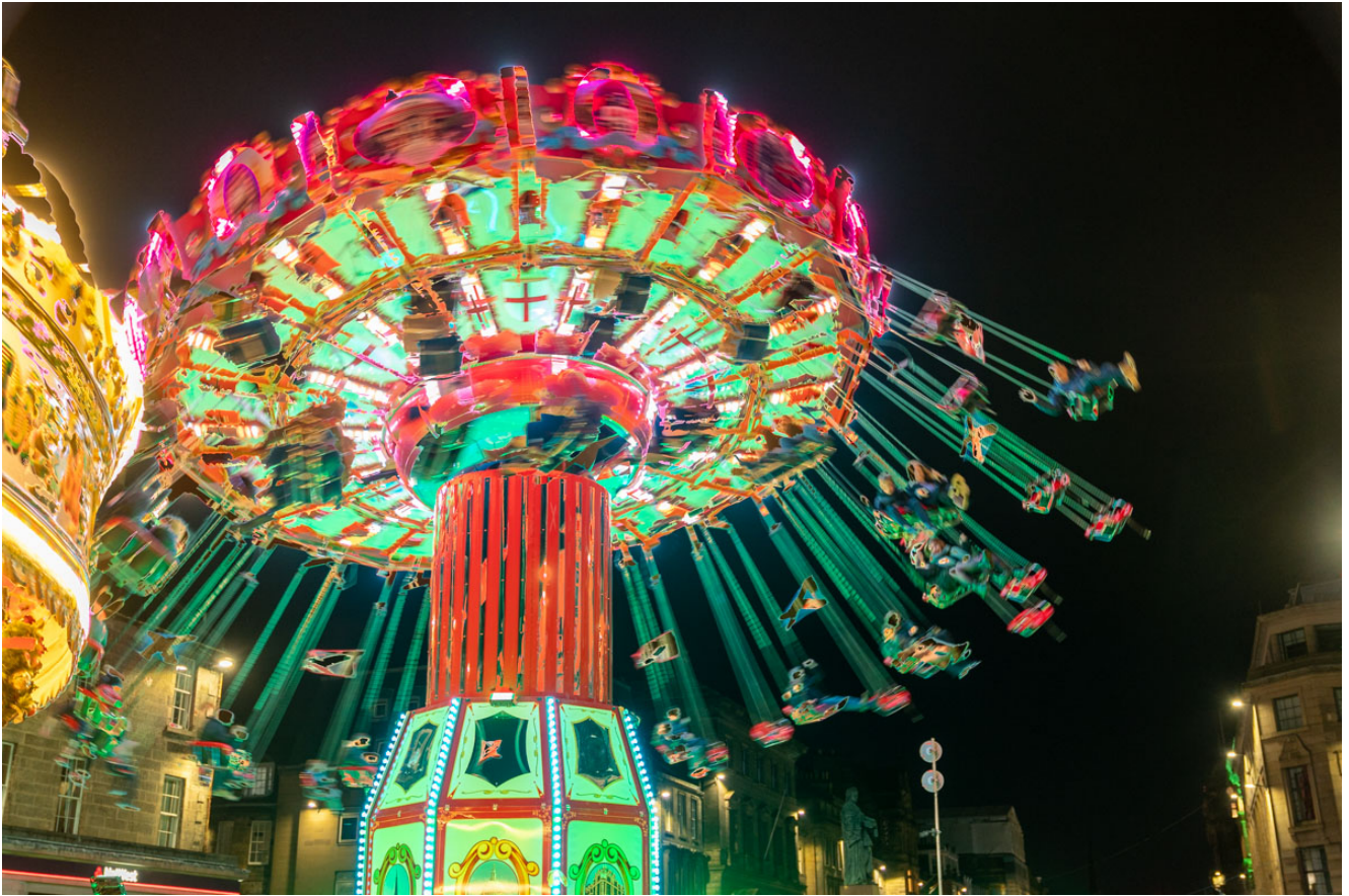
Edinburgh Christmas 2022.