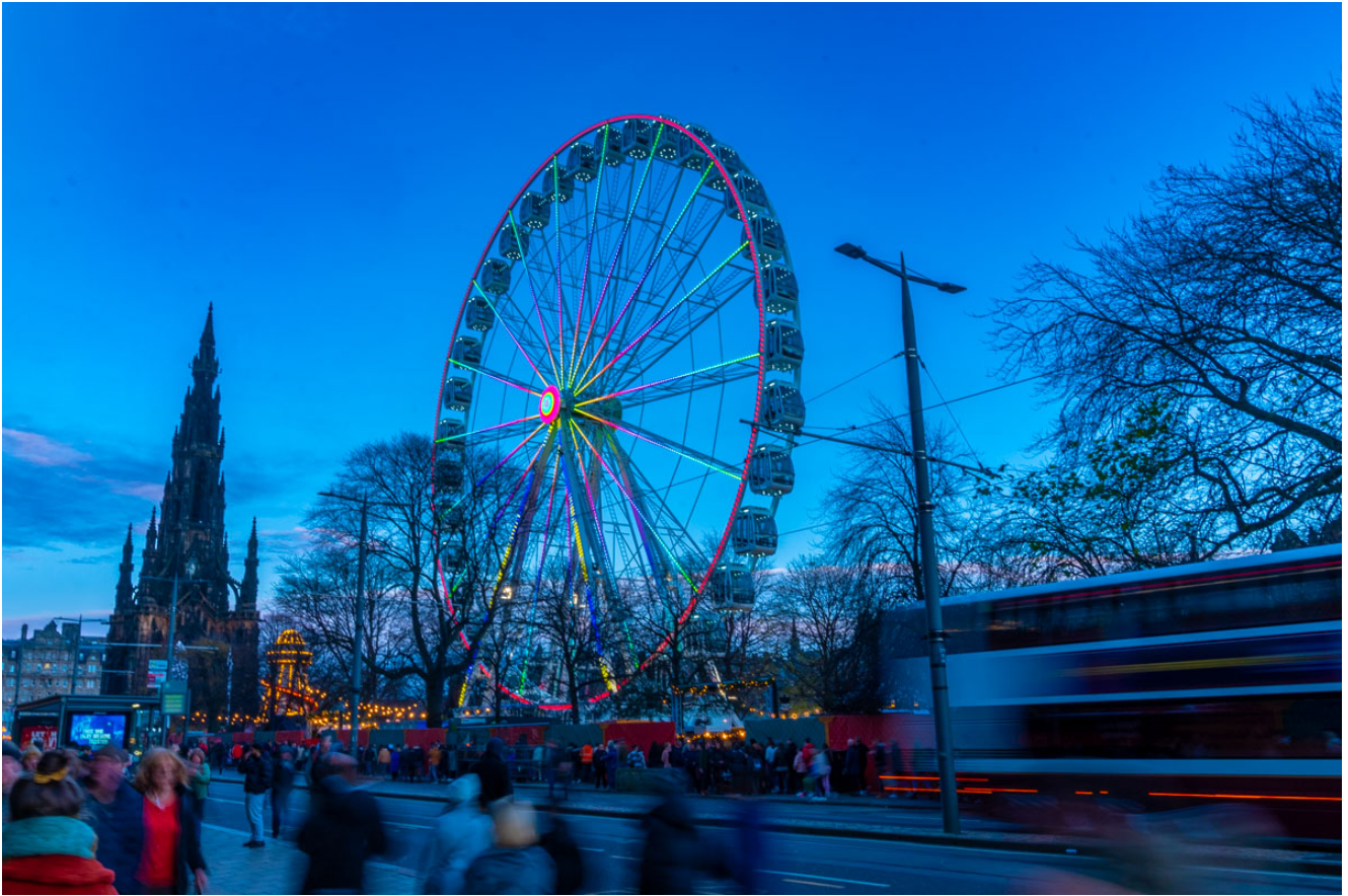
Edinburgh Christmas 2022.