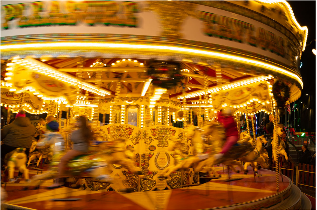
Edinburgh Christmas 2022.