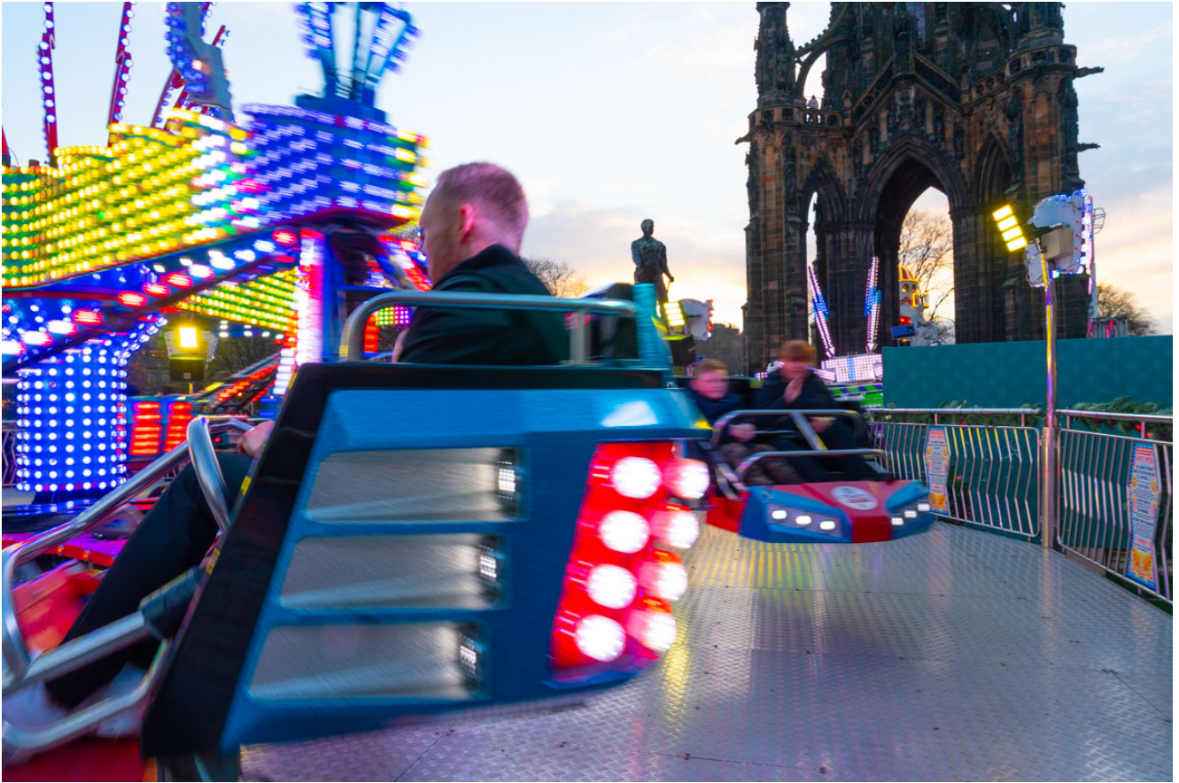
Edinburgh Christmas 2022.