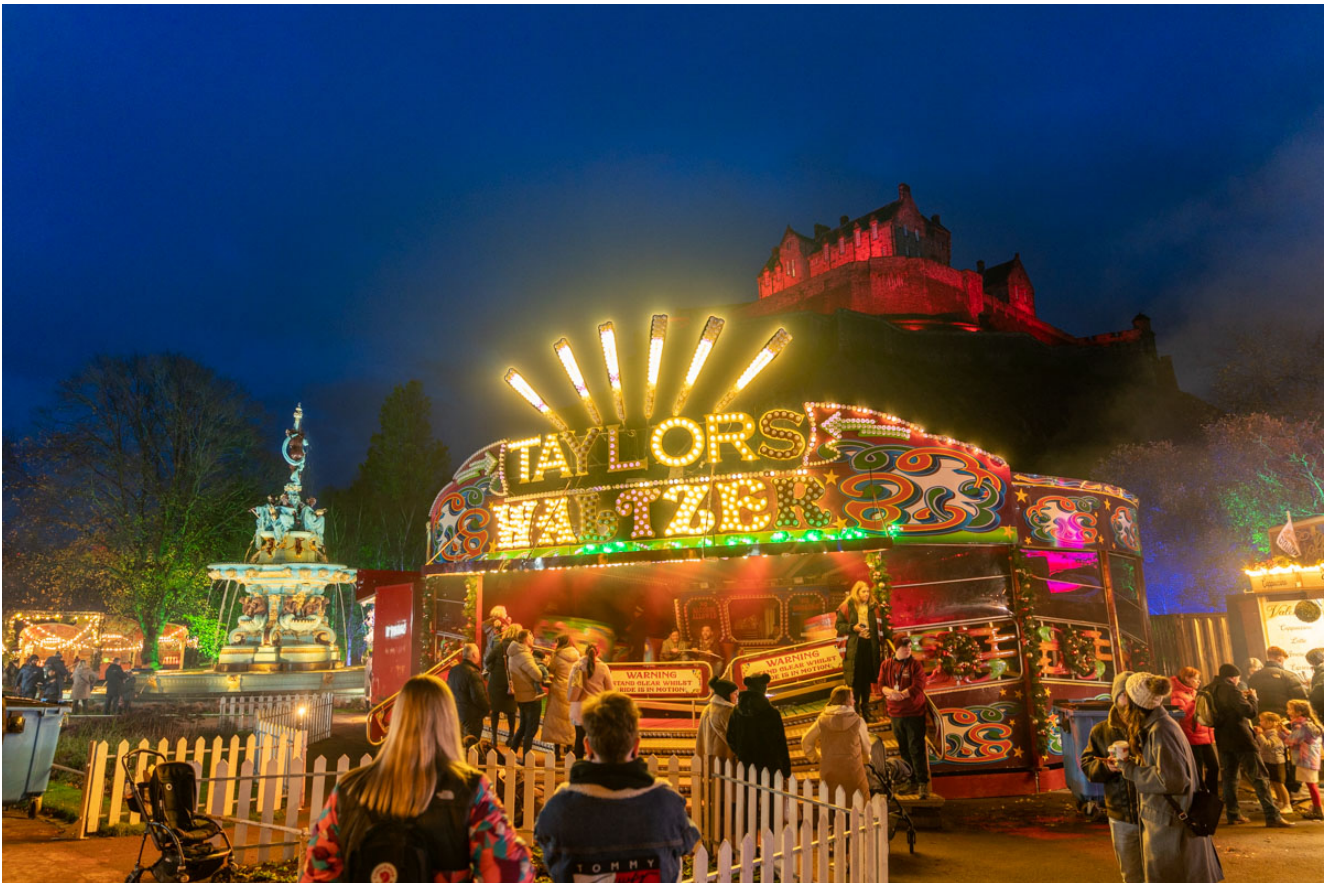
Edinburgh Christmas 2022.