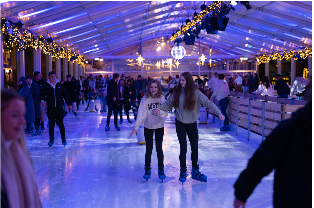
Edinburgh Christmas 2022.