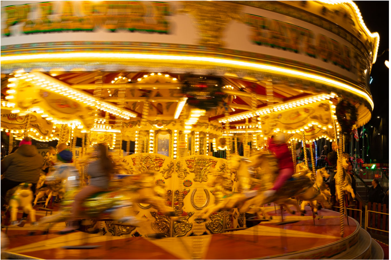
Edinburgh Christmas 2022.