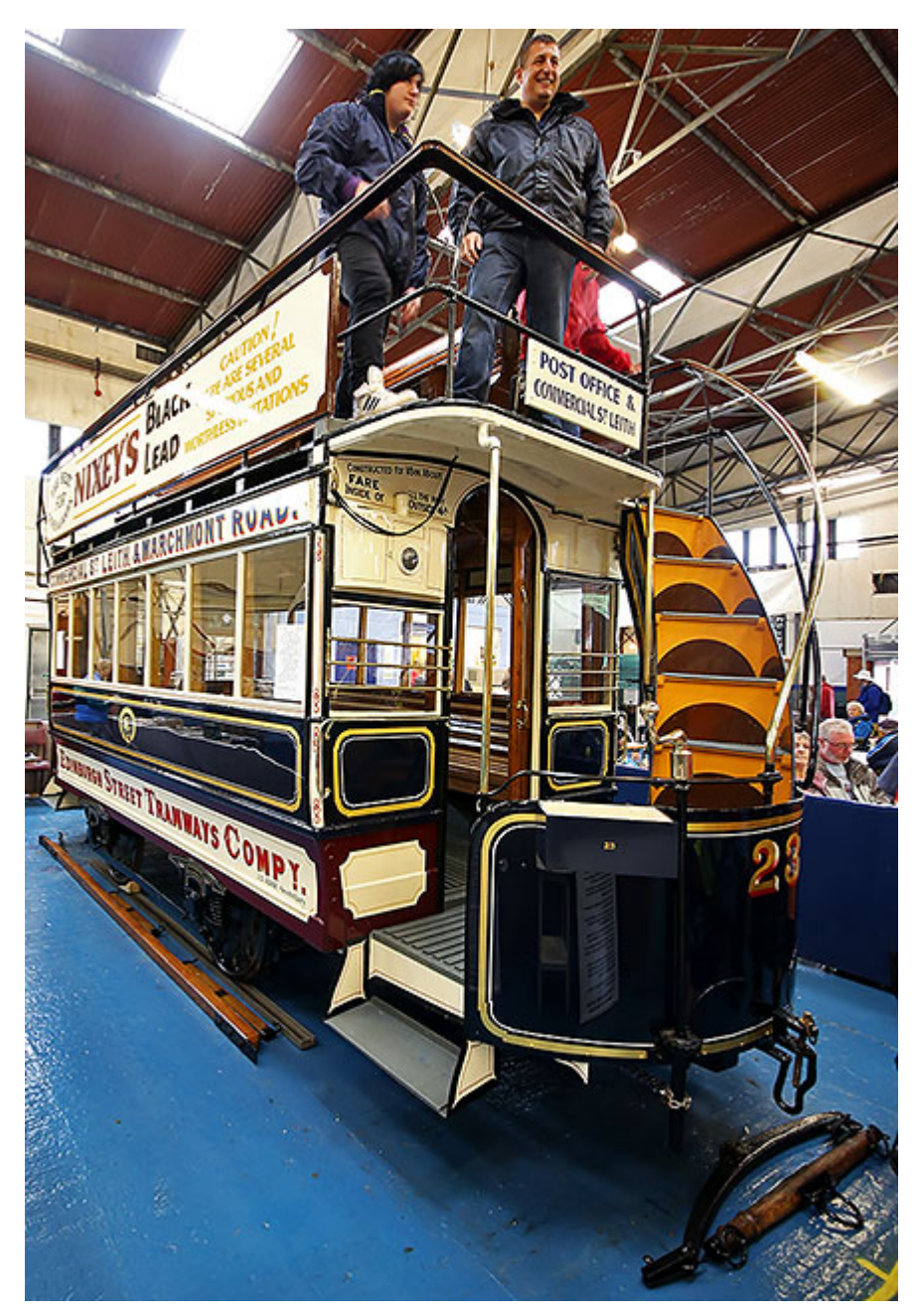
Horse Tram car number 23