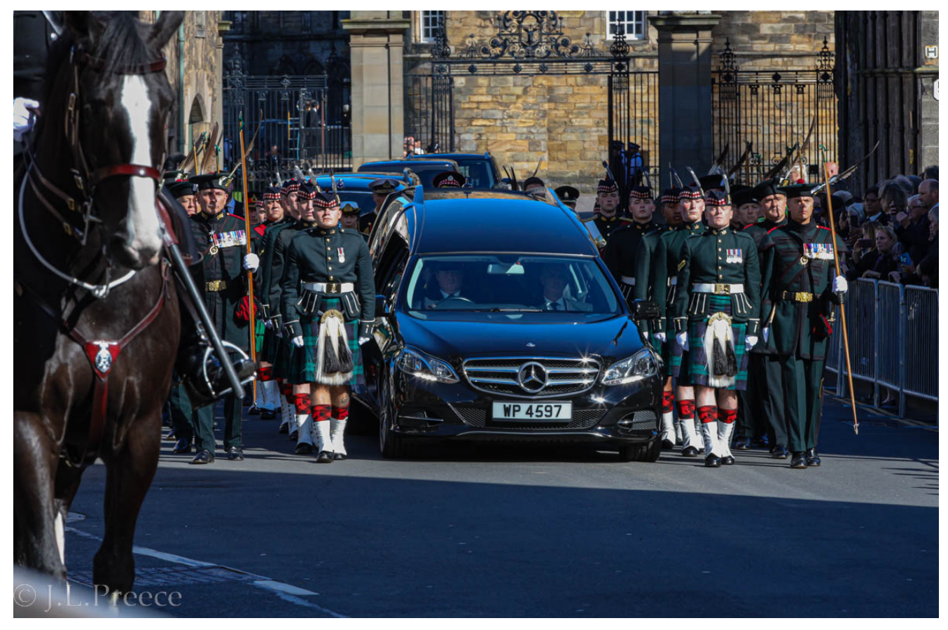
HM The Queen, Edinburgh, 12th Sept 2022