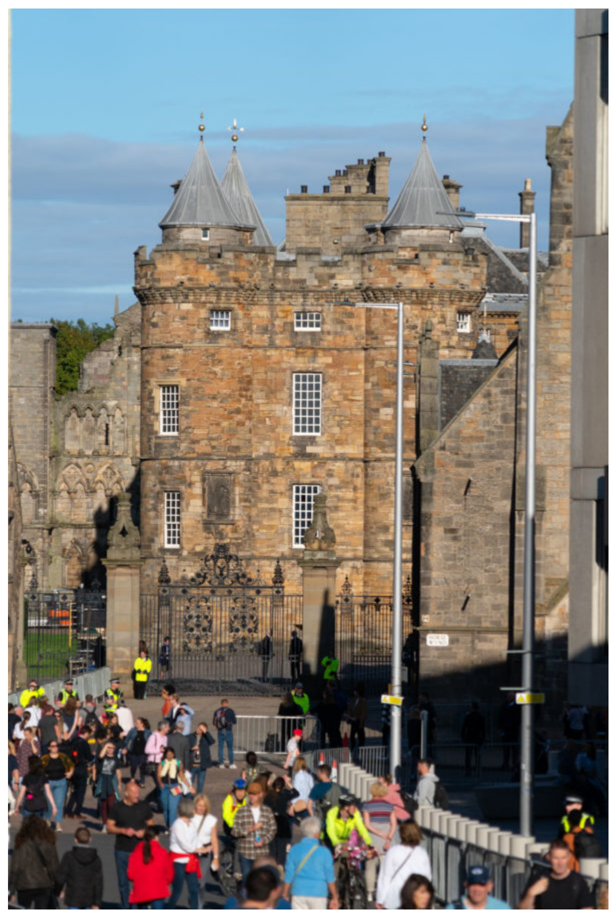
First Minister Nicola Sturgeon said: "Her Majesty's death at Balmoral Castle means Scotland has lost one of its most