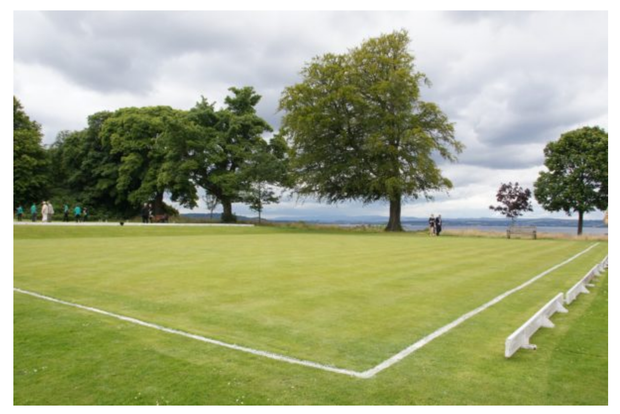
The beautiful croquet lawn at Lauriston Castle