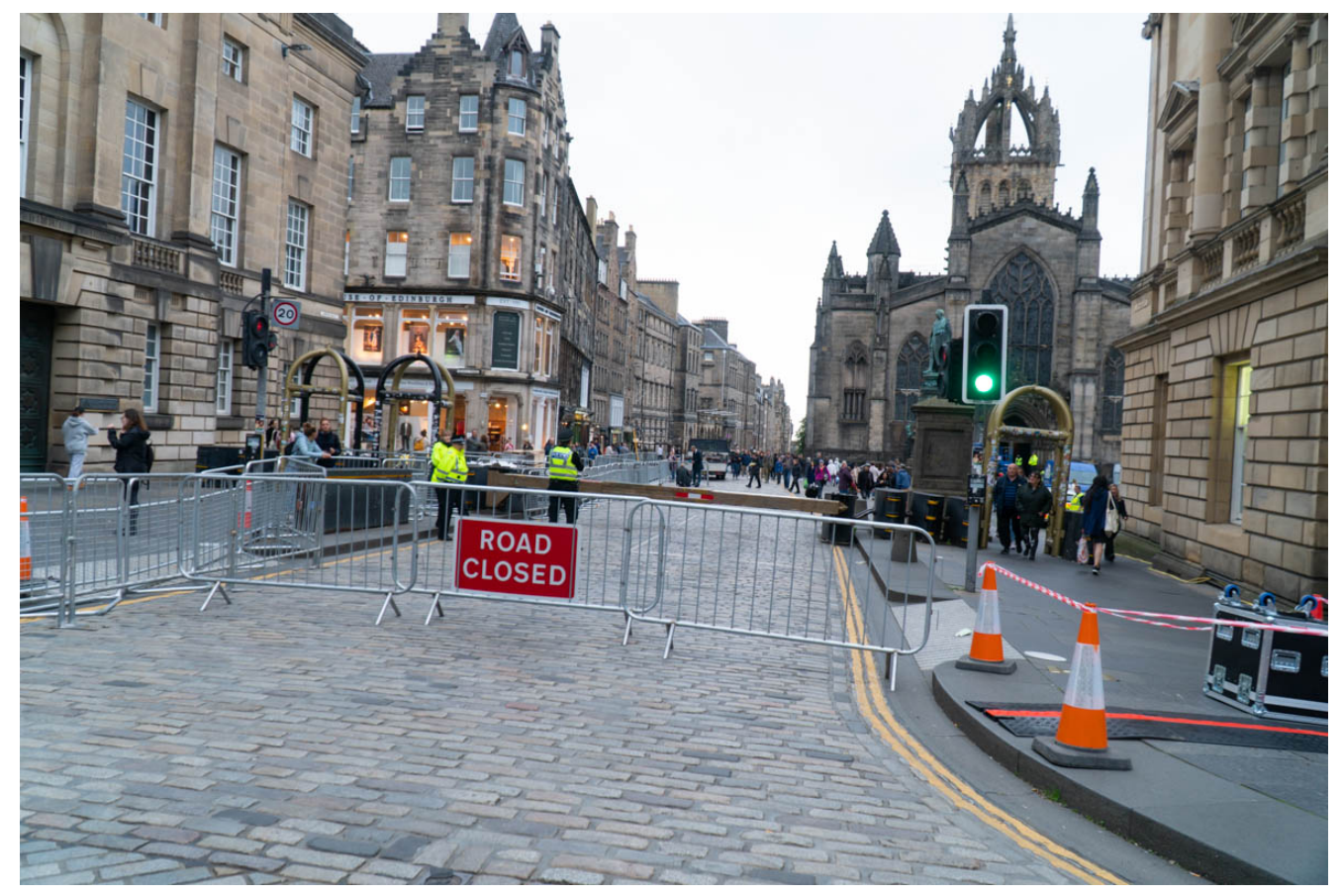
Scenes around The Palace of Holyroodhouse on Friday one day