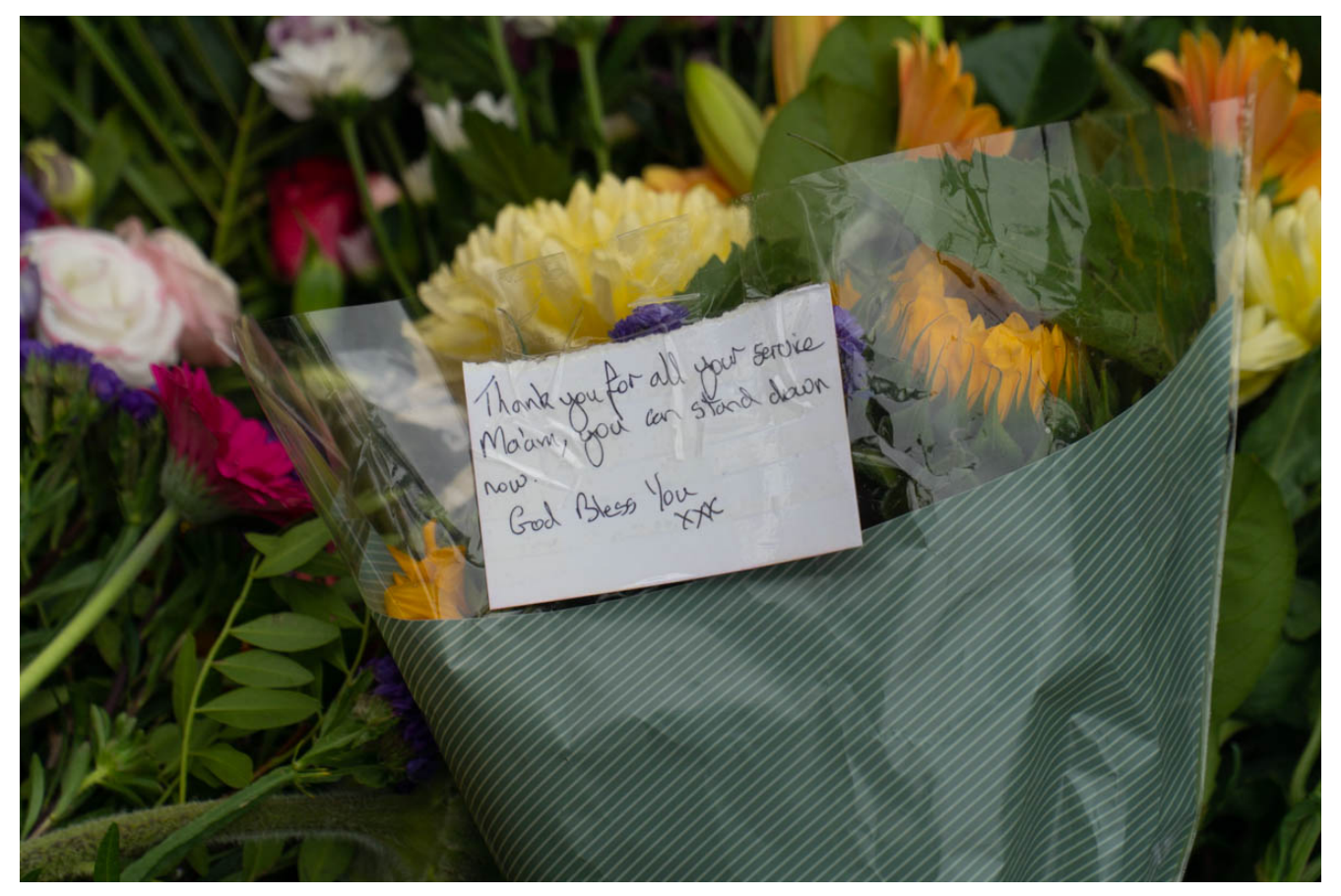
Scenes around The Palace of Holyroodhouse on Friday one day after the death of HM THe Queen was announced.