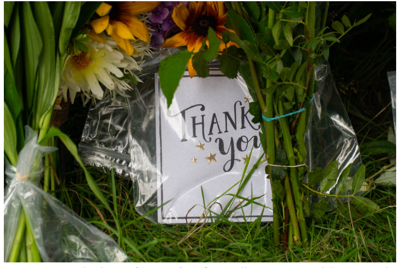
Scenes around The Palace of Holyroodhouse on Friday one day