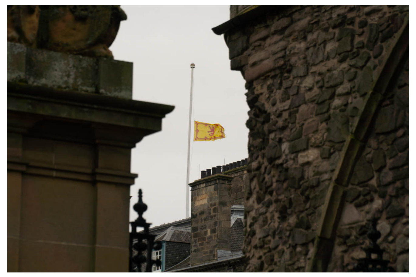
Scenes around The Palace of Holyroodhouse on Friday one day after the death of HM THe Queen was announced. PHOTO @2022\ \mbox{The Edinburgh Reporter}