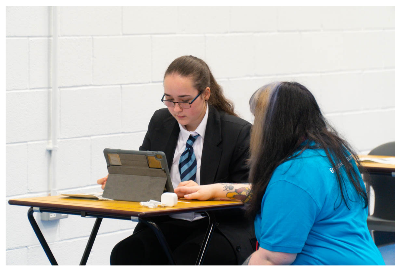
Craigroyston Community High School pupils received their new iPads today and were getting help to set them up before lessons

The roll-out meets an element of one of the 15 outcomes and actions from the previous administration's three year business plan <u>'Our Future Council, Our Future City'</u>: 'increasing attainment for all and reducing the poverty-related attainment gap'. The business plan was approved by then councillors during their <u>budget meeting</u> on 18 February 2021 when they also agreed £8 million funding for additional digital devices.