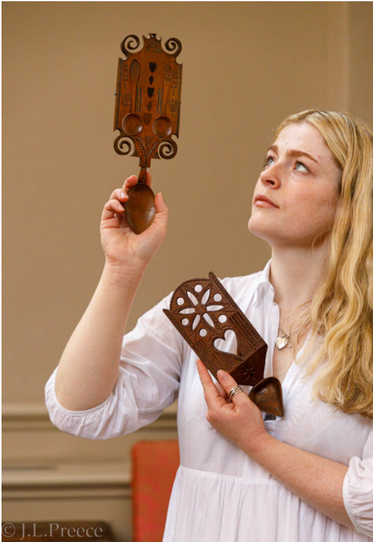
A late 19th century love spoon, together with another The broad handle carved and pierced with a heart and flower head, together with a second example with broad pierced