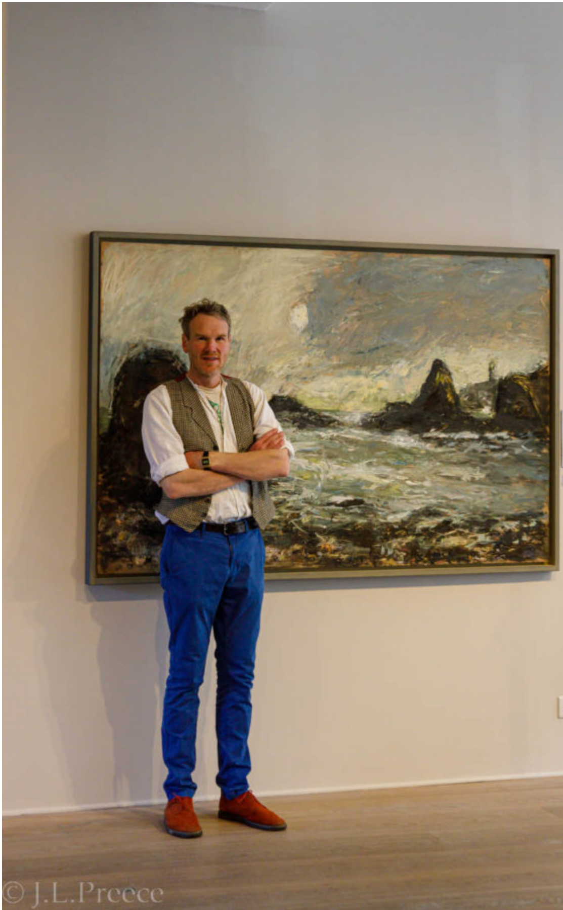
Title From Crinan to Catterline Exhibition Dates Thursday 1st September 2022 – Saturday 24th September 2022