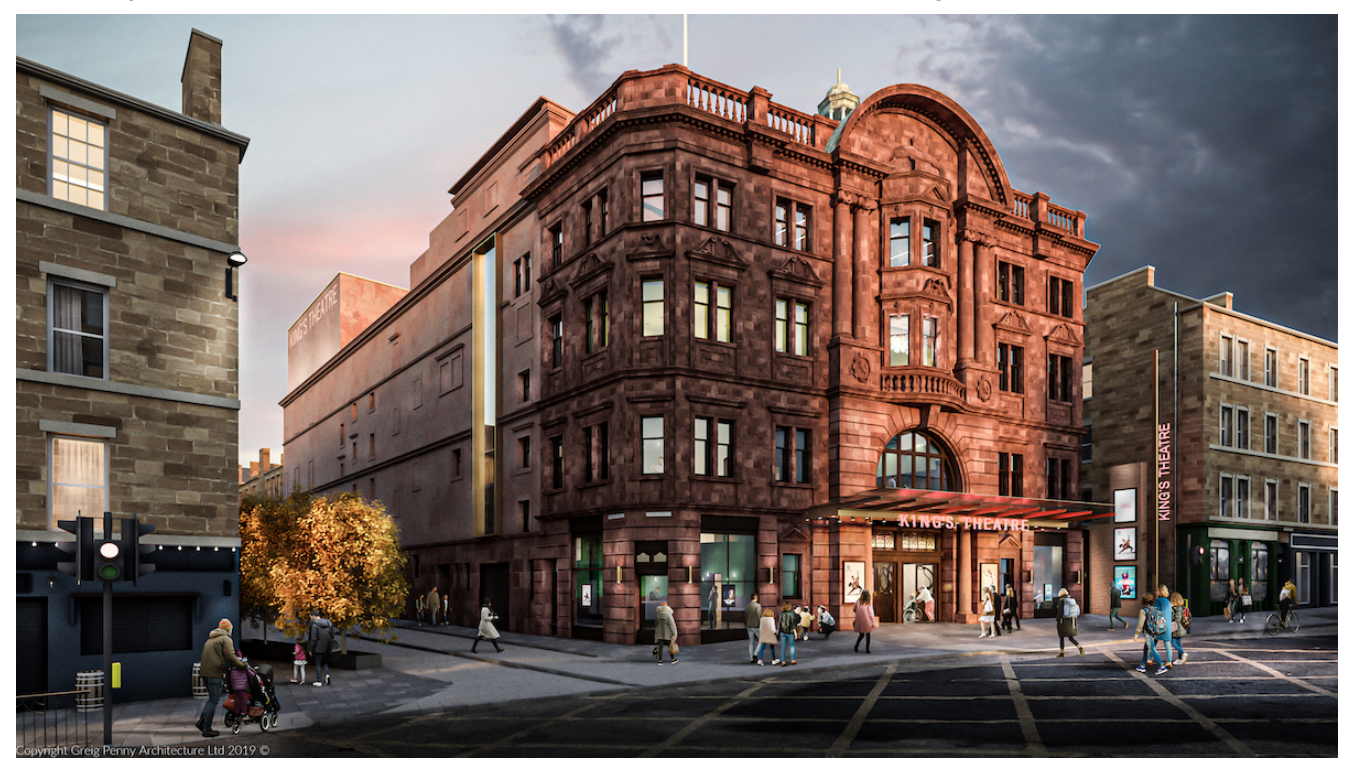
Visualisation of the new King's © Greig Penny Architecture Ltd