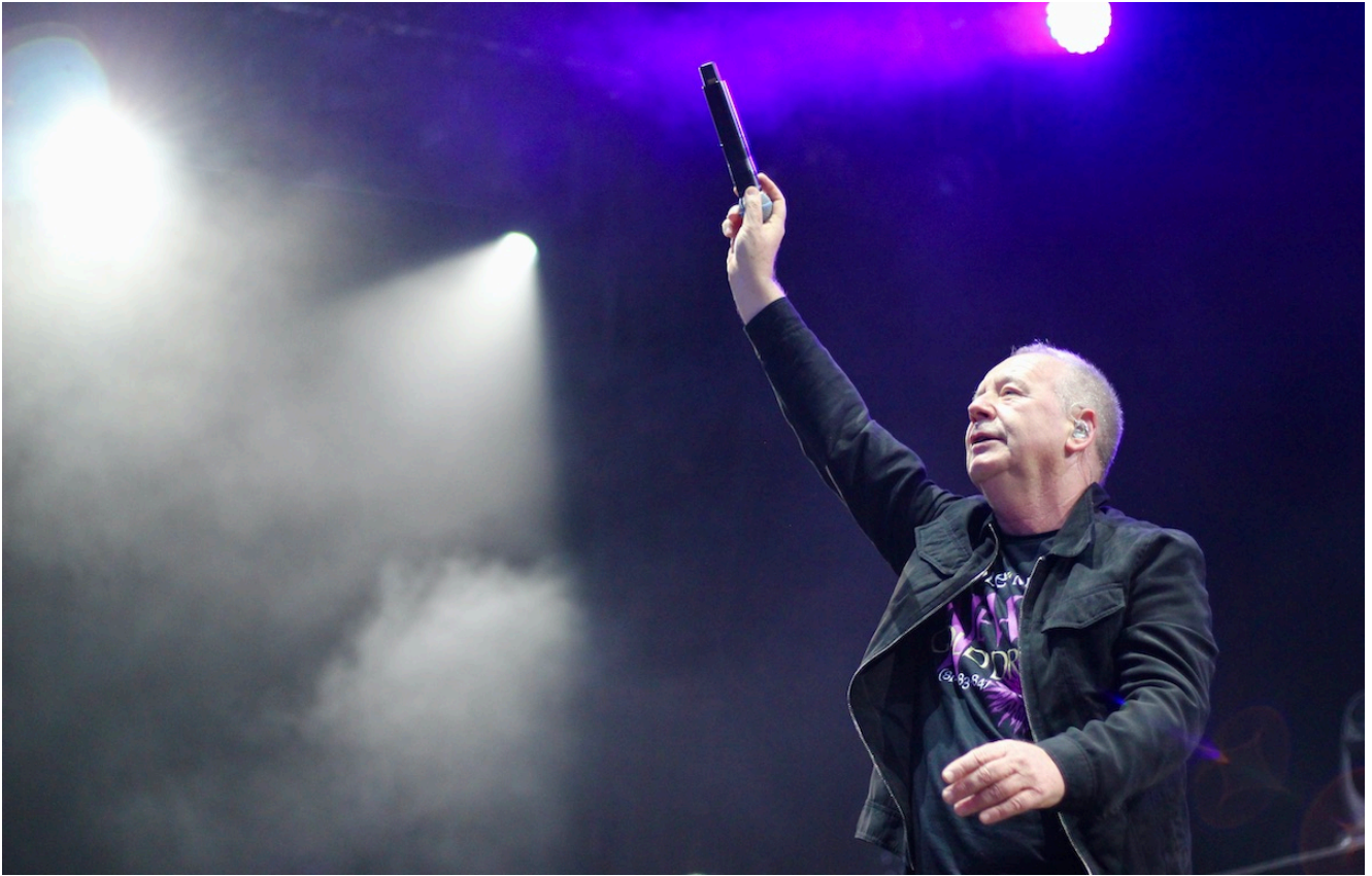
PHOTO of Him Kerr