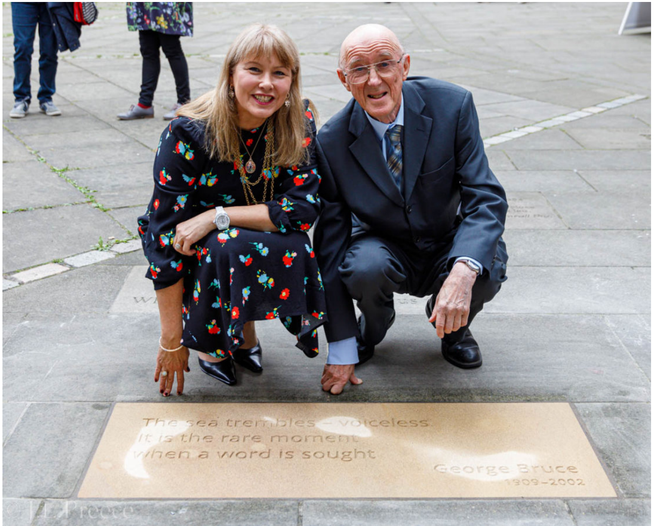
George Bruce Flagstone Unveiling, Makar's Court, Edinburgh, 23rd Aug 2022