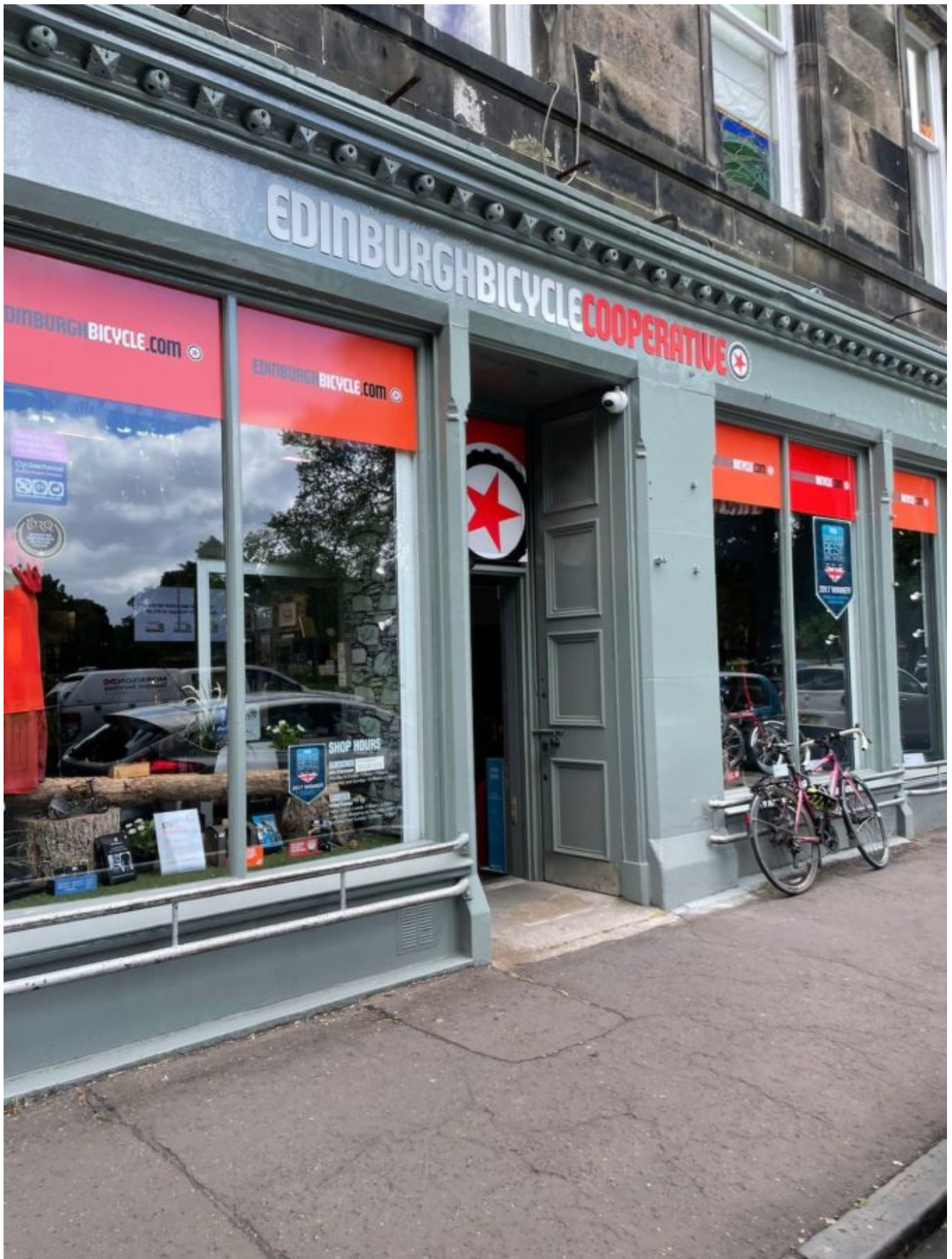
The Bruntsfield Shop