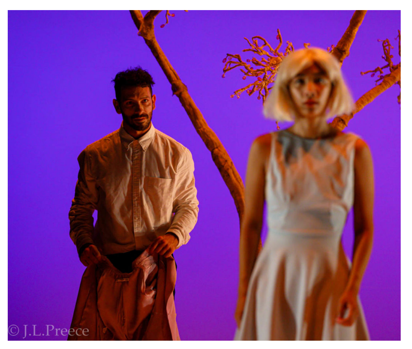
'We Are Monchichi' is on at The Studio from Fri 19\,-\,\mathrm{Sun}\ 21\,\mathrm{Aug}

More information and ticketing <u>We Are Monchichi | Edinburgh</u> <u>International Festival (eif.co.uk)</u>