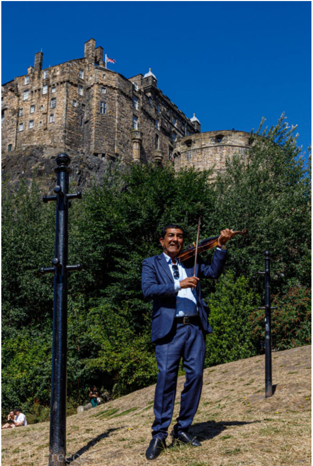
Gheorghe 'Caliu' Anghel – Taraf de Caliu, Granny's Green