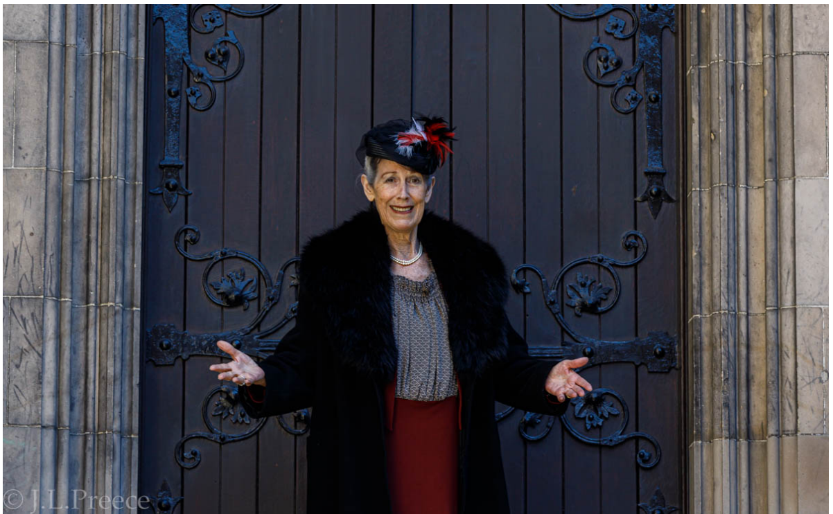
Eleanor Roosevelt – Mrs Roosevelt Flies to London, St Giles Cathedral, Edinburgh.10th August 2022