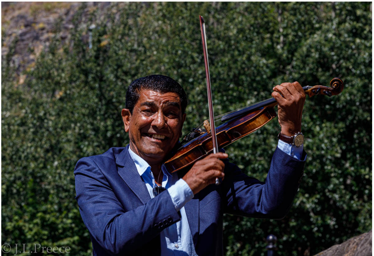
Gheorghe 'Caliu' Anghel – Taraf de Caliu, Granny's Green