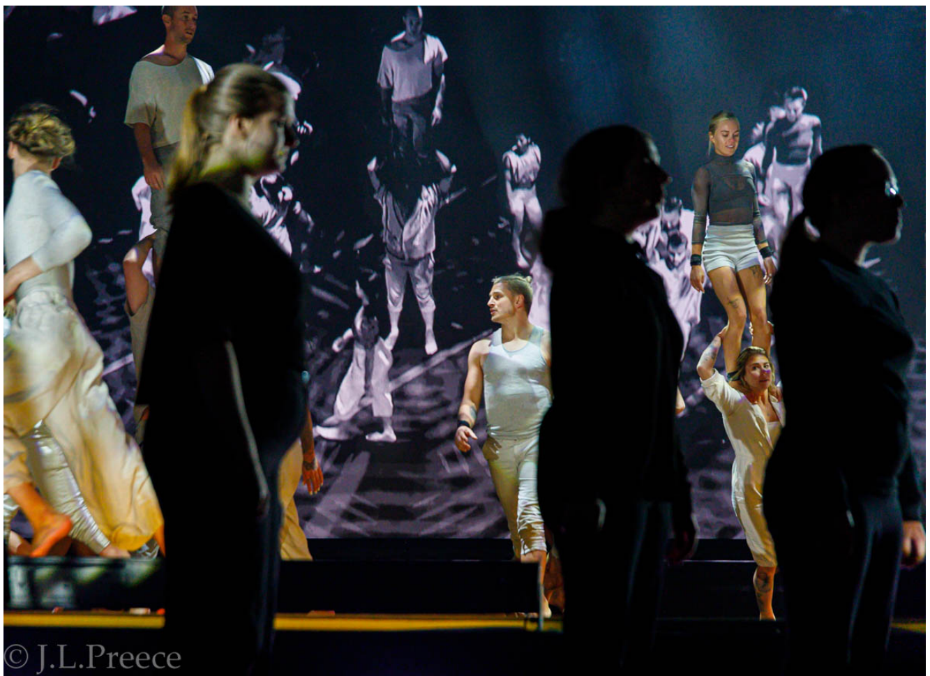
Part of the UK/Australia Season 2021-22, a joint initiative of