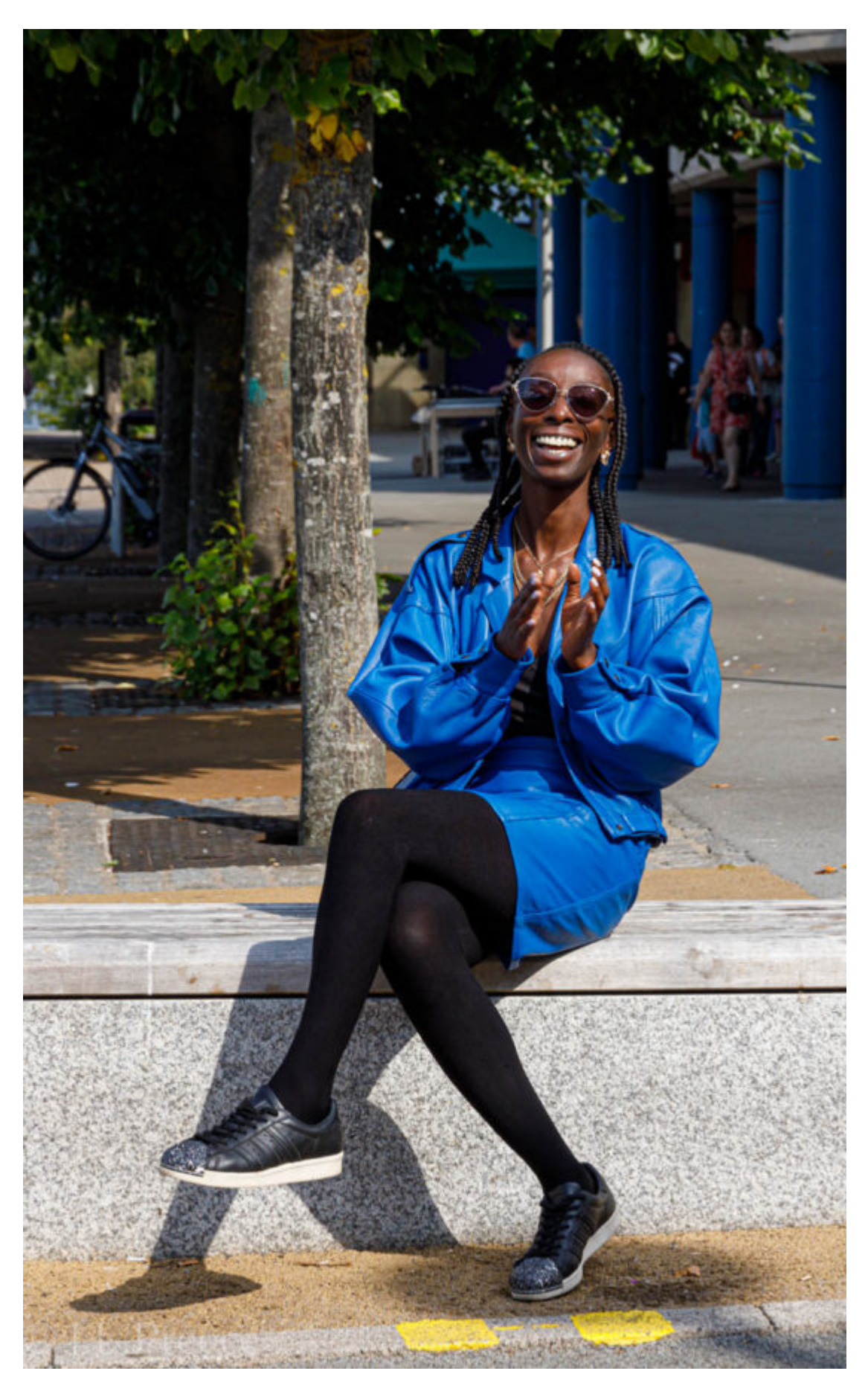
Eunice Olumide MBE, Scottish actress and model — Community Wellbeing Project, Wester Hailes, Edinburgh, 13th Aug 2022